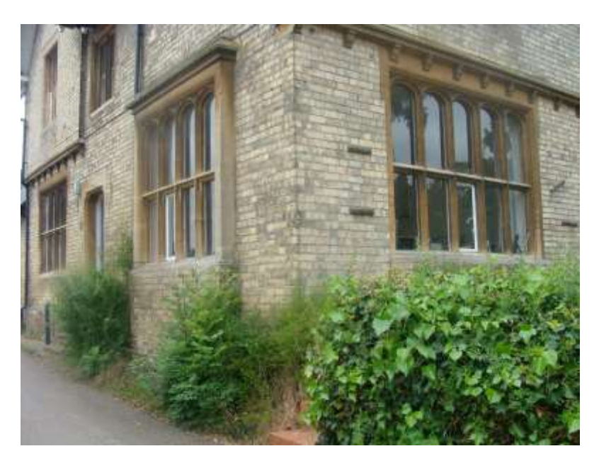
Picture 16 - Fine mullioned window detailing to nos. 92 - 96 High Street. Is there any local information as to the buildings original use?

6.30. Nos. 92 - 96 High Street (south side). 19<sup>th</sup> century terrace, tall and prominent adjacent to Listed Almshouses. Constructed of yellow stock brick with slate roof and 5 no. chimneys. There is a brick by the side entrance initialed and inscribed 1857. A dominant building in the street scene with fine mullioned window detailing to ground and first floors. Single storey brick with slate outbuildings to the rear have original wooden doors and ironmongery. An Article 4 Direction to provide protection for selected features may be appropriate subject to further consideration and notification.