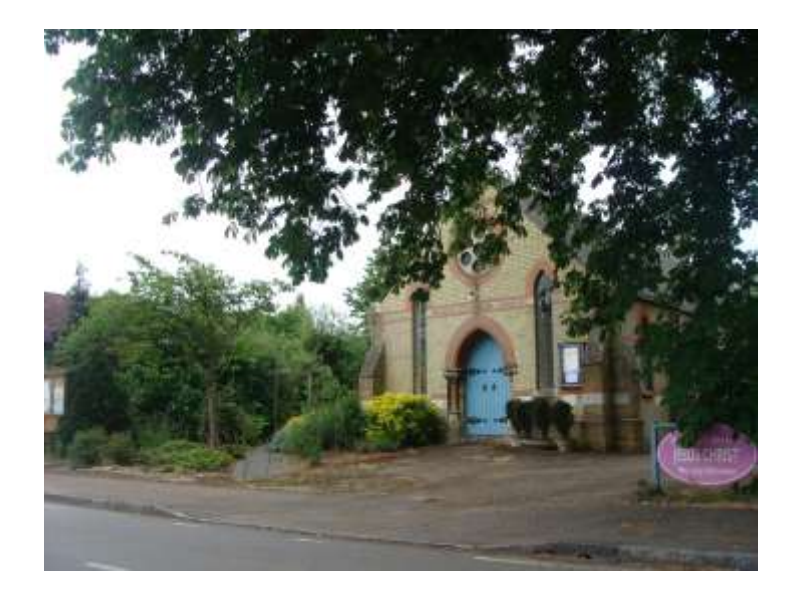
Picture 14 – Wesley Centenary Church, High Street, a fine example and representative of its type built in the late 19<sup>th</sup> century: a potential candidate for formal listing.

6.23. Wesley Centenary Church, High Street (south side). Single storey late 19<sup>th</sup> century church constructed in 1891 of yellow stock brick with horizontal red brick banding and window detailing. Central entrance doorway to front elevation with decorative iron hinges and typical decorative Victorian column detailing with distinctive circular window above. Inscription to front elevation reads WESLEY- CENTENARY-CHURCH. Leaded windows to side elevations, probably original, 18 in number. Some window replacements to rear elevation. This building is particularly noteworthy for its historical associations and because it is typically representative of its type and period. Because it is largely unaltered it may be considered a potential candidate to become formally listed. Protection of its important external features is secured by existing planning controls.