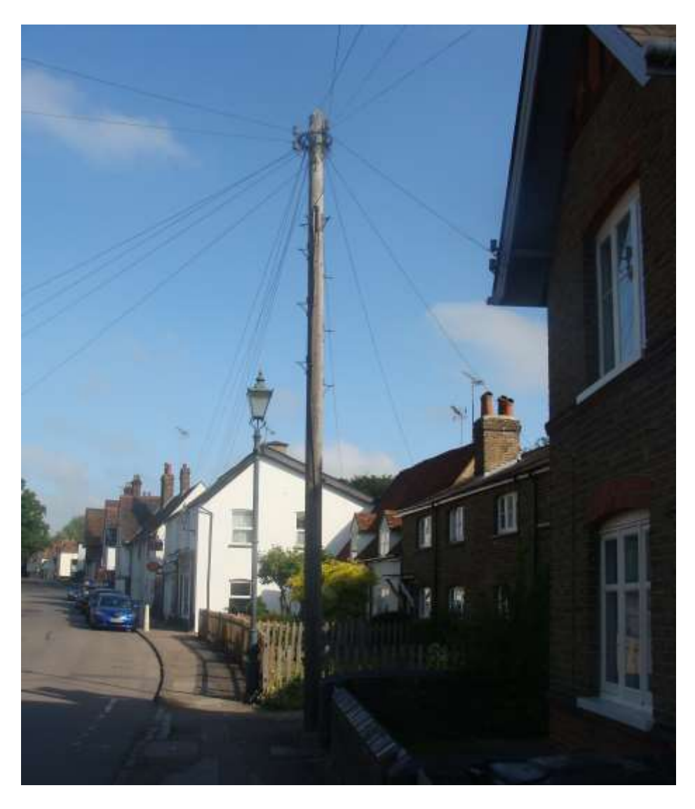
Picture 20 - One of several disruptive utility poles in the High Street.

6.46. Utility poles. There are a number of utility poles in the Conservation Area that detract to varying degrees. There are however three particularly detract namely one near the Village Pump; one outside nos. 93- 95 High Street and one outside no. 133 High Street.