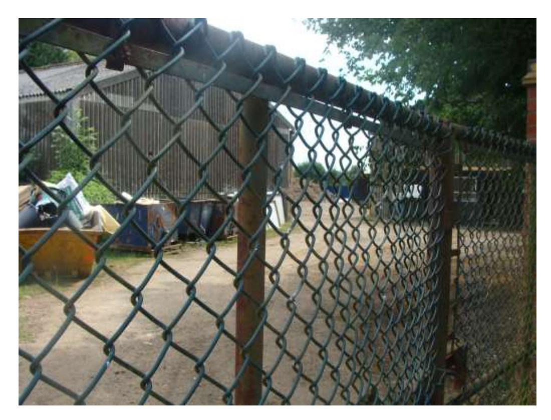
Picture 31 - Land west of Ponderosa and the Moat House, off Perrywood Lane, one of two areas excluded from the Conservation Area.

6.81. Opportunities to secure improvements. In respect of land to the west of Ponderosa and the Moat House, carefully evaluate and assess the potential for improving the untidy nature of the site.