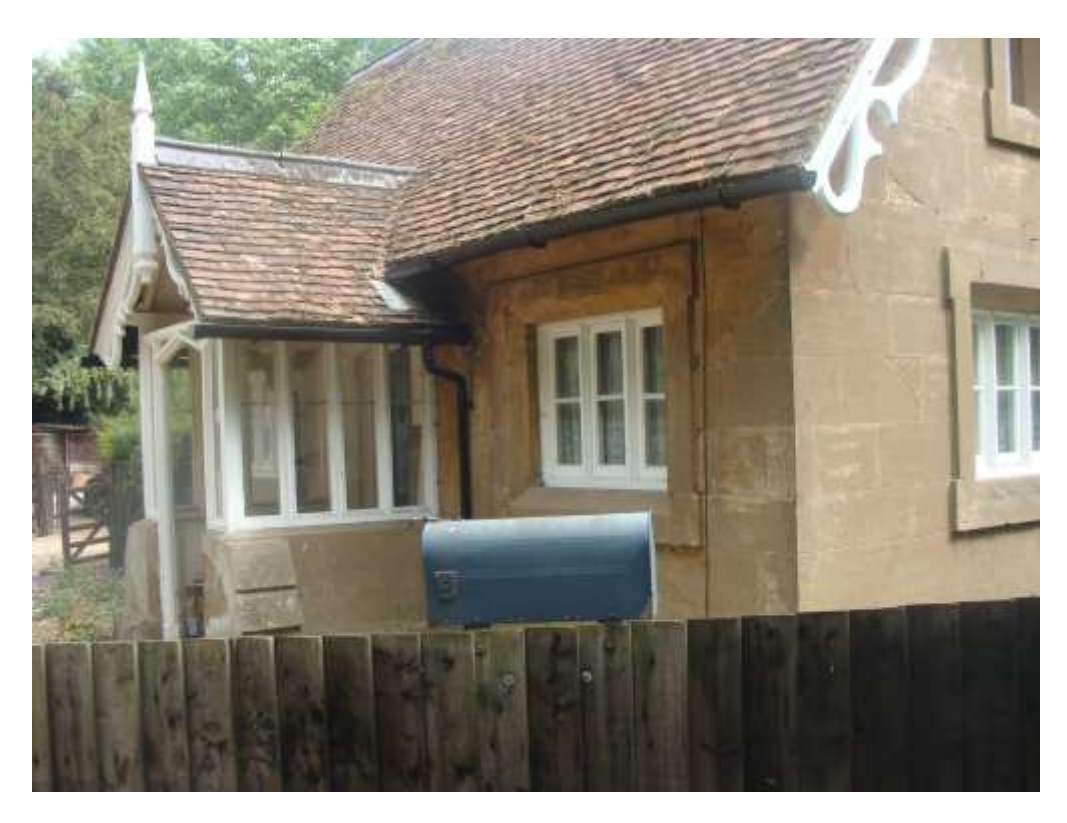
Plcture 22 - Watton Lodge a delightful lodge building of ashlar facing over brick and typical Victorian barge board detailing.

6.57. Other buildings that make an important architectural or historic contribution. Watton House Lodge, Ware Road. Single storey 19<sup>th</sup> century Lodge to Watton House. Ashlar finish applied to brickwork; steeply sloping tiled roof. Decorative barge board detailing and large chimney to rear also in ashlar finish. Original window detailing. An Article 4 Direction to provide protection for selected features may be appropriate subject to further consideration and notification.