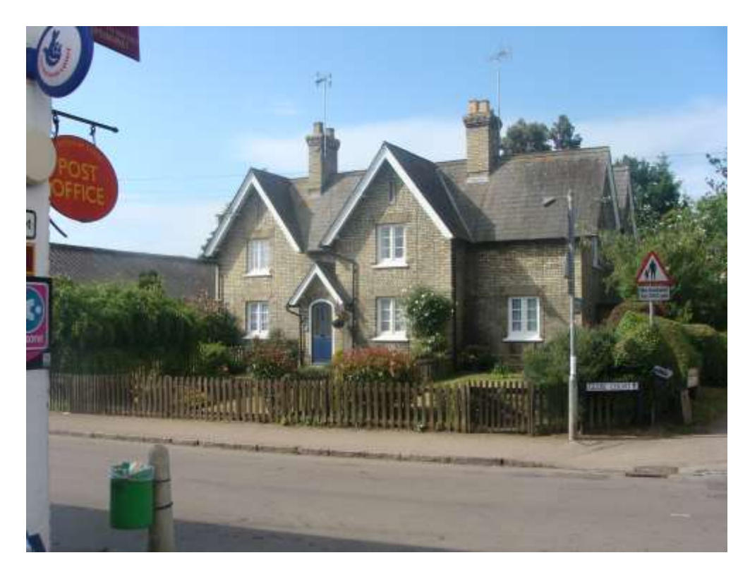
Picture 17- No.114 High Street, an unlisted building that adds considerable quality to the street scene in this location.

protection for selected features may be appropriate subject to further consideration and notification.