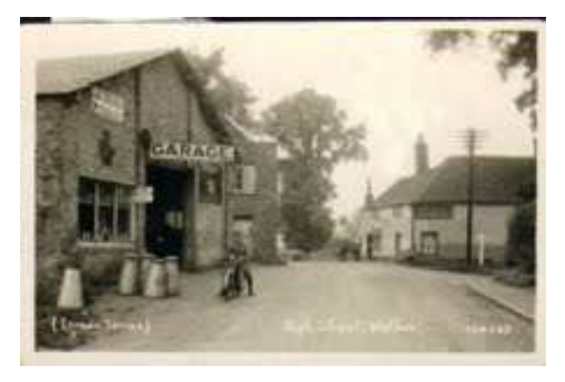
Picture 4 - Mid 20<sup>th</sup> century photograph of the garage that previously existed opposite the former Waggon and Horses PH.

3.16. In addition to farmers, trades listed are as follows: 3 no. shopkeepers, 3 no. builders, 2 no. bakers, 2 no. shoemakers, 2 no. beer retailers, , a miller, a harness maker, a tailor, a wheelwright, a surgeon, a draper, a butcher, a plumber and painter, a grocer and shoemaker. Three Public Houses are listed namely the Bull Inn, the George and Dragon and the Waggon and Horses. In common with other rural settlements of this time, Watton at Stone was a dynamic largely self sufficient community supporting a wide range of trades.