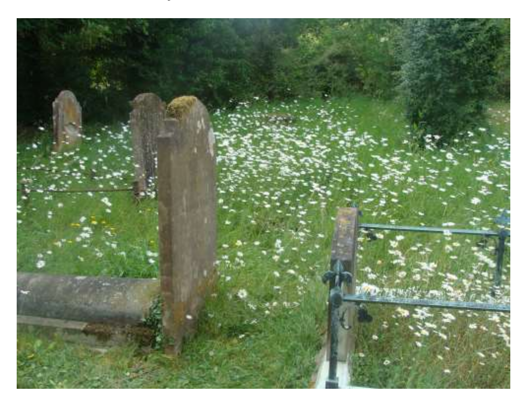
Picture 28 - The Parish church graveyard, it contains many interesting tombstones.

6.73. Church graveyard. The graveyard contains a large number of historic tombstones, the earliest of which dates from the 13<sup>th</sup> century, the latter being located adjacent to the south wall of the church. Within the graveyard are a number of mature trees including a mature Chilean Pine, planted in the 19<sup>th</sup> century.