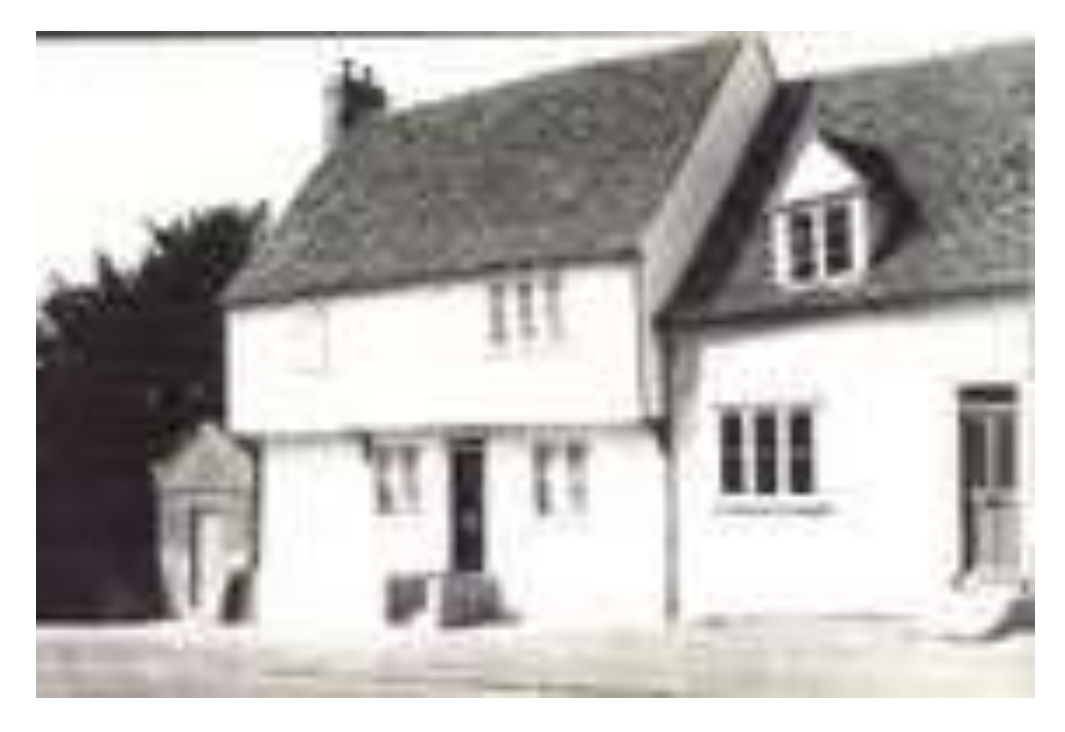
Picture 11 - The small detached building on the left of the photograph was a 19th century lock up. Its interesting and unusual former use could usefully be identified by a discreet plaque. The front entrance door is now blocked up.

6.9. The former Lock up (now ancillary to no.87 High Street). The Listed Building description describes it thus: 'a small rectangular chamber with a smaller room added to rear later in C19 to accommodate constable's office at front and 2 cells. Original door to road now blocked'. This small building is unusual and part of the rich historical heritage of the village. It is suggested that the vegetation be removed and with the owners cooperation and consent, acknowledge its previous use by adding a discreet plaque.