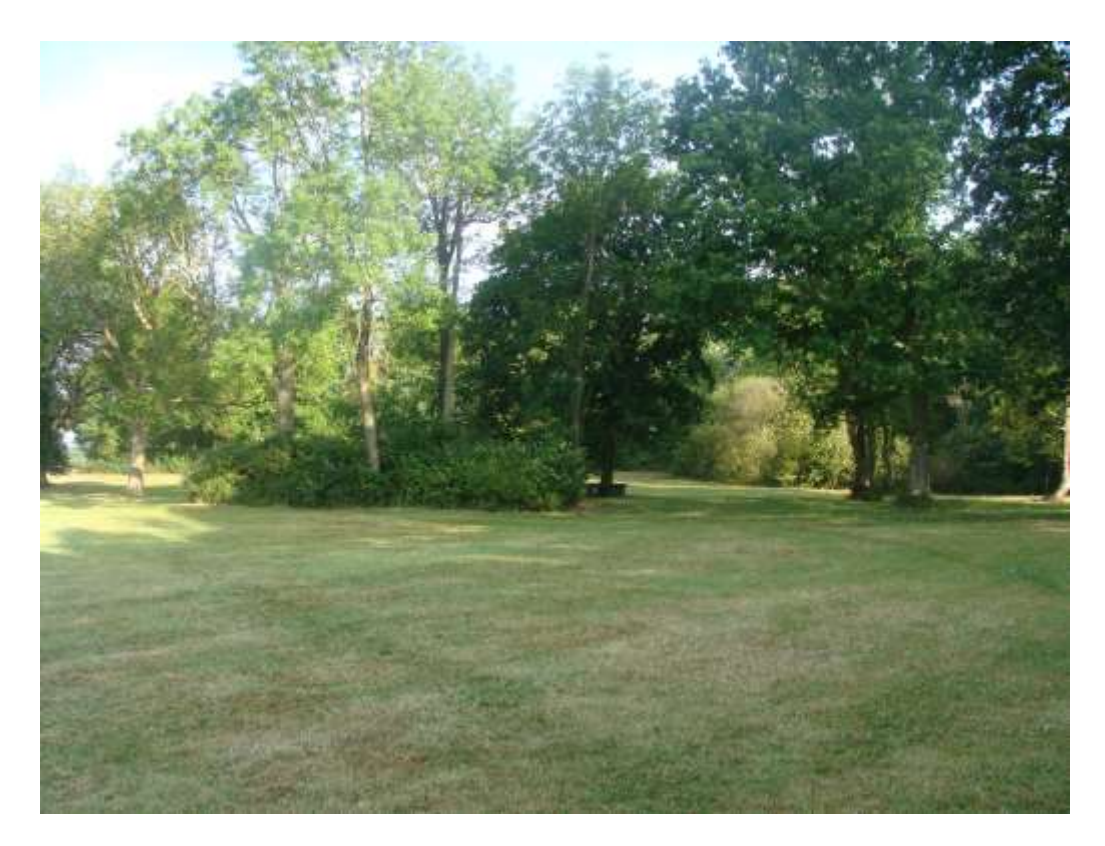
Picture 29 - Watton Green, together with surroundings is an open space of quality and part of a area of visual and ecological importance.

6.75. The organizations responsible for the maintenance of the above open spaces are commended for the care and attention being provided.