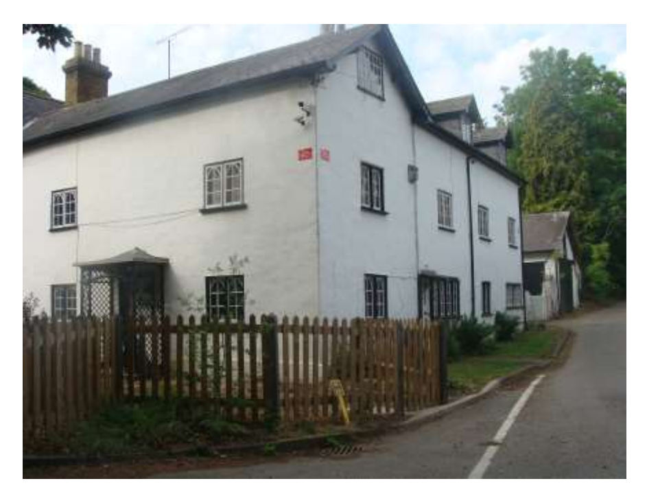
Picture 23 - Watton Cottage an unlisted property with many original features, worthy of additional protection.

6.59. Watton Cottage, Church Lane. A 19<sup>th</sup> century 2 storey house that is important and dominant in the local scene. Rendered finish and slate roof, dormers and chimneys. Various original windows, some with Lancet detailing, others have horizontal sliding sashes. Wooden porch detailing to east elevation. An Article 4 Direction to provide protection for selected features may be appropriate subject to further consideration and notification.