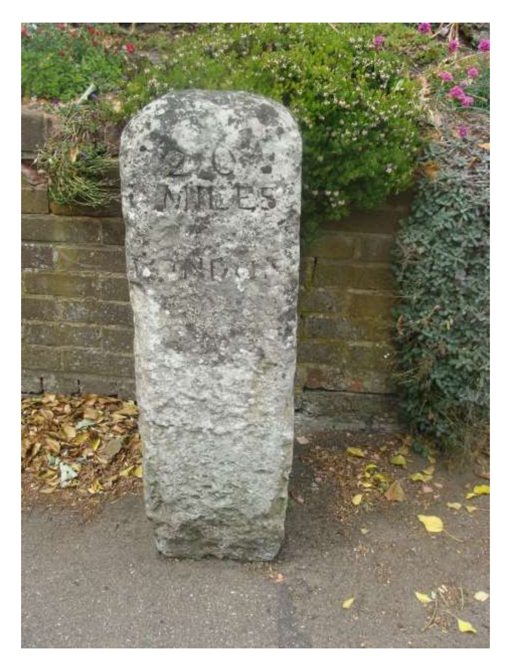
Picture 12 - Listed Milestone, cleaning, general restoration and repainting is recommended. It is included in the Council's Buildings at Risk Register.

6.11. Representing the 20<sup>th</sup> century is the K6 Telephone Kiosk in the High Street designed in 1935 by Sir Giles Gilbert Scott, constructed of cast iron with domed roof and crowns to top panels.