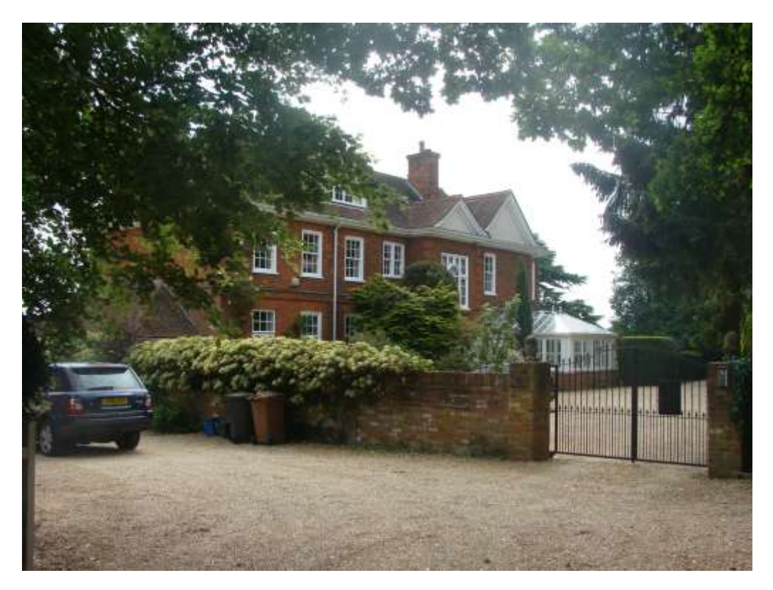
Picture 27 - Glebe House, The second Rectory probably built early 20<sup>th</sup> century (architects were Milne and Hall). An imposing residence of quality.

6.63. Other distinctive features that make an important architectural or historic contribution. 19<sup>th</sup> century wall from River Beane crossing (south side) to a point some 100m south east of Watton Cottage. In excess of 1m in height and so protected from demolition without prior consent, where it abuts highway. Section along track south east of Watton Cottage has collapsed. Ideally need repair/replacing but original purpose may no longer be relevant. Need to discuss issue with owner before making any practical recommendation.