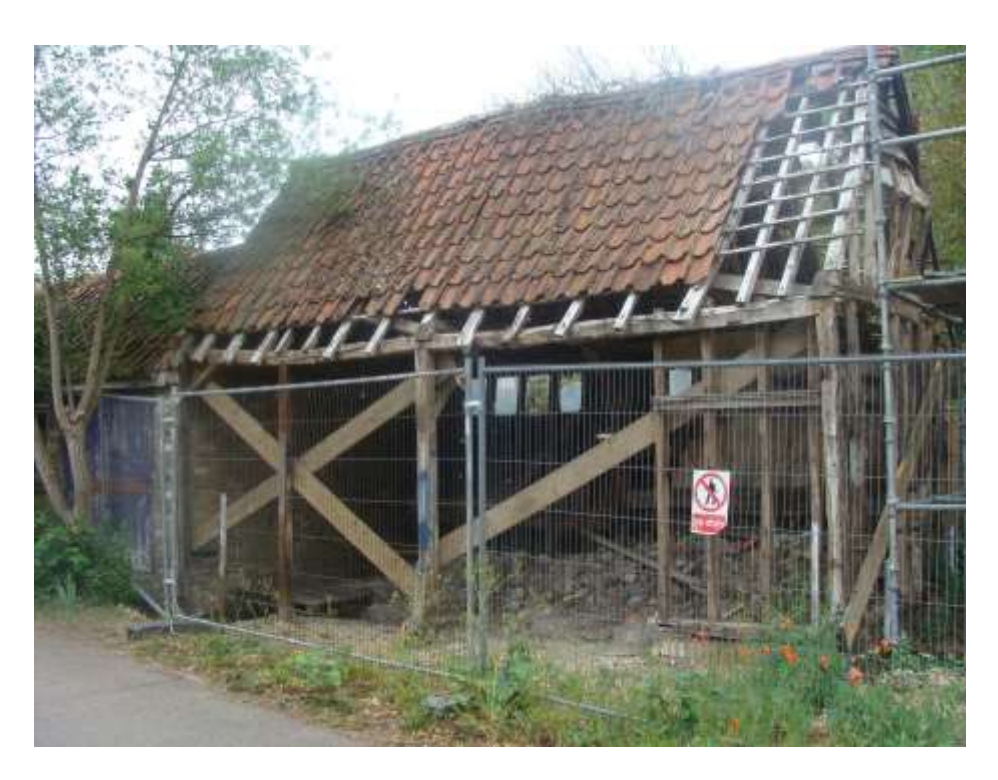
Picture 13- Outbuilding within the curtilage of a Listed Building off White House Close in urgent need of restoration.

6.15. Outbuilding off White House Close. 19<sup>th</sup> century or earlier, single storey, pantiled roof and weather boarding to northern elevation. Southern elevation supported with temporary wooden supports to prevent potential collapse and roof partly removed. Planning permission incorporating it within residential development granted. Need to establish owner's current intentions and proceed accordingly. A candidate for inclusion on Council's Buildings at Risk Register.