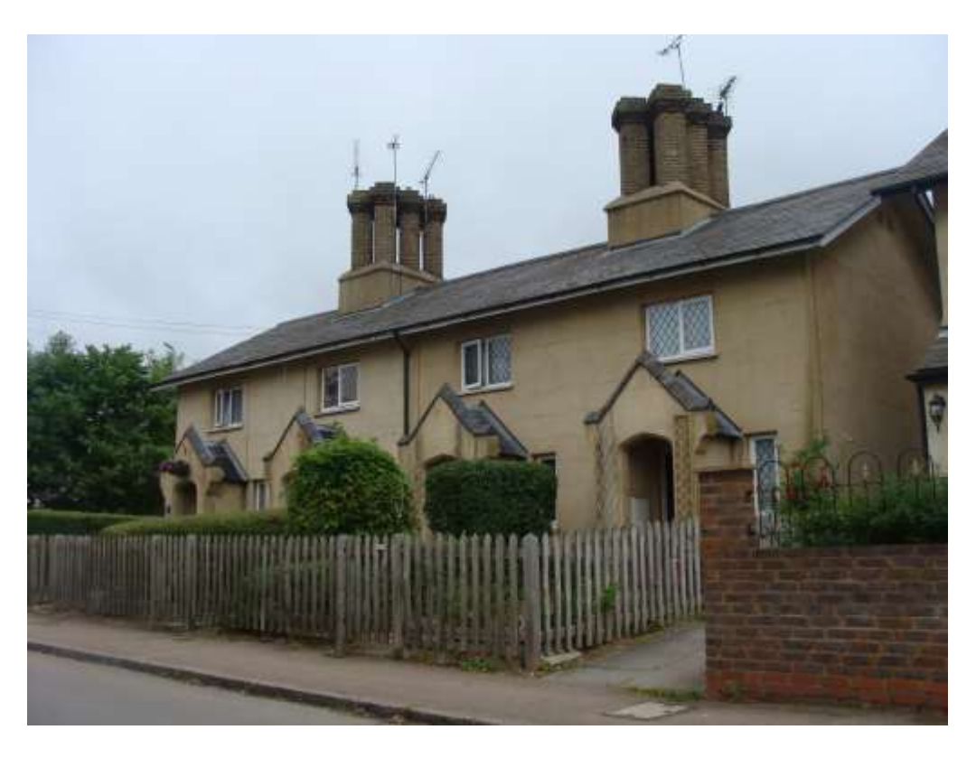
Picture 6 - Chimneys are a very important architectural feature in the local streetscapes. There is an extensive range of types and sizes throughout the village.

4.7. Any other distinctive features that make an important visual or historic contribution are noted.