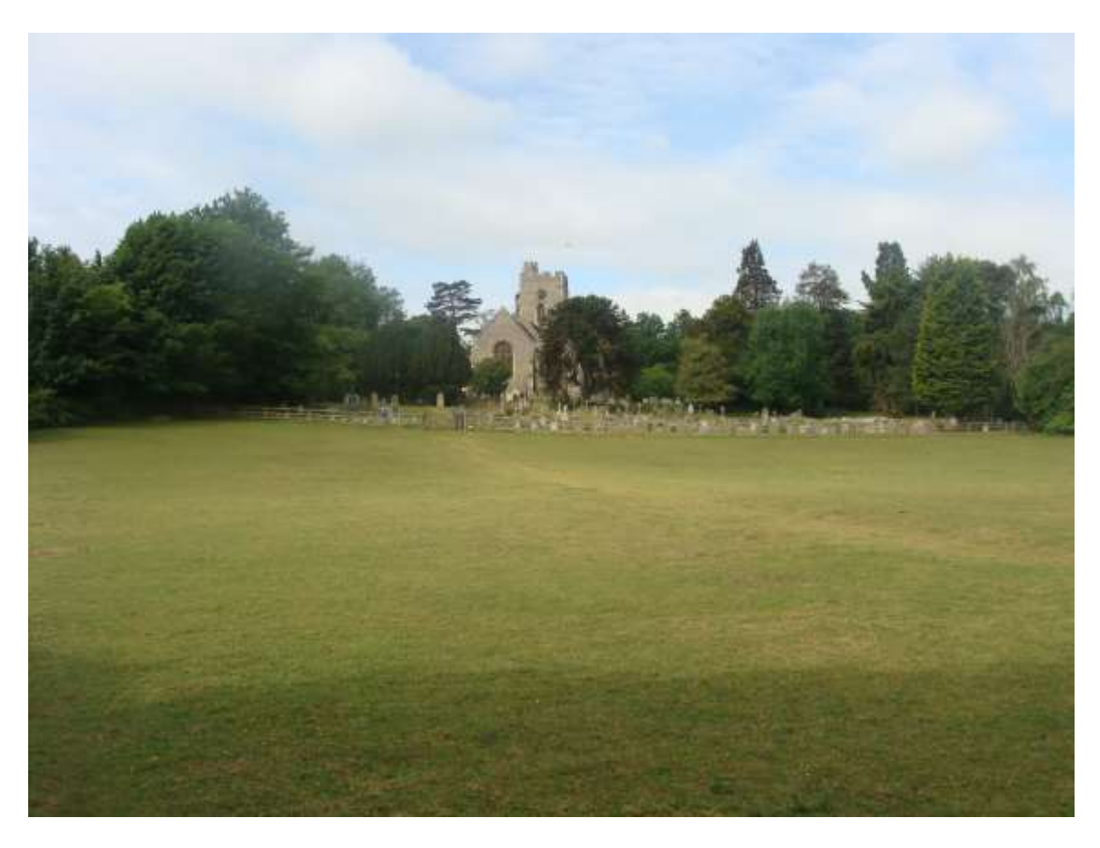
Picture 8 - Looking towards the dominant church tower from the War Memorial across an open space of great quality.

5.4. Secondly there is an extensive open area, the focal point of which is the Parish Church. This area extends to the south to include Watton Green and is linked to the main village by Church Path which is a public footpath. This area consists of well maintained sports facilities, allotments, public and private open spaces, pasture land, parkland, hedges, sunken lanes, woodland, designated Wildlife Sites and a village green that is well removed from the village to the south. This area is extensively treed and includes a number of mature exotic parkland varieties especially popular with the Victorians and likely planted from about the mid 19<sup>th</sup> century. Apart from a few modern buildings scattered in large plots the area has retained its essential open character.