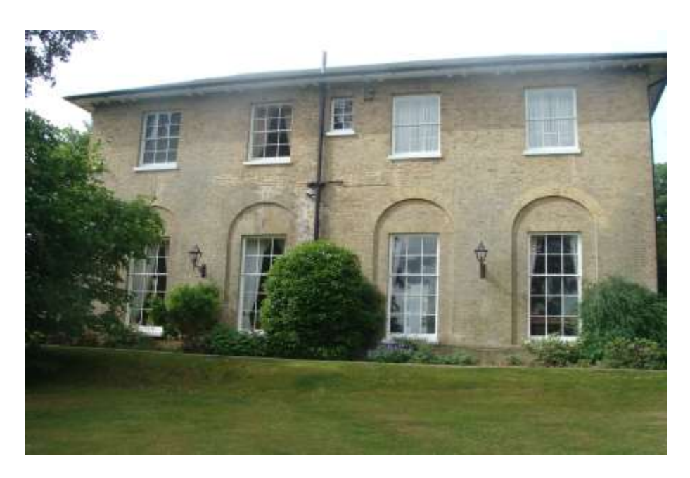
Picture 25 - North elevation of Crowbury off Church Lane as it is today.

6.61. Crowbury, Church Lane, adjacent to and west of the Church. Crowbury was formerly the Rectory. A large imposing 2 storey 19<sup>th</sup> century yellow stock brick residence with slate roof, distinctive chimneys and many original sliding sash windows. Several modern extensions have been added. The whole is set in extensive grounds with mature trees and formal garden to south east. An Article 4 Direction to provide protection for selected features may be appropriate subject to further consideration and notification.