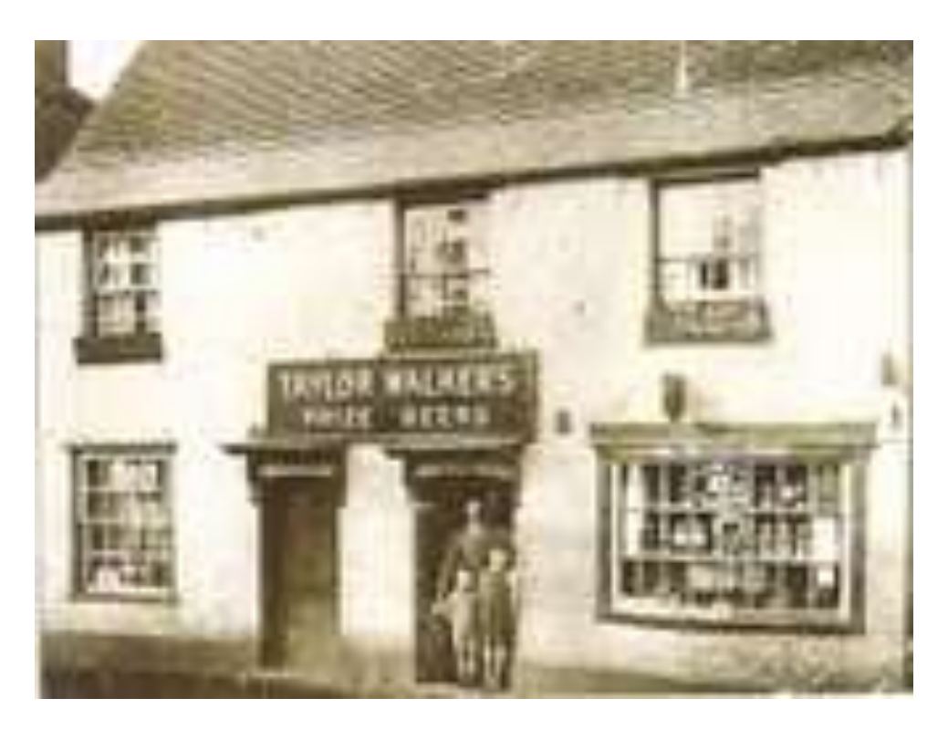
Picture 5 - former retail premises, now in residential use as nos. 69-71 High Street.

3.17. The Place names of Hertfordshire published by Cambridge University Press refers to the following ancient names; Wattun (969), Wodtone (1086), Watton Stone (1304), Watton atte Stone (1311), Wotton at Stone (1462) and Wattonstrete (1463). The name possibly derives from wad and ton meaning woad farm.