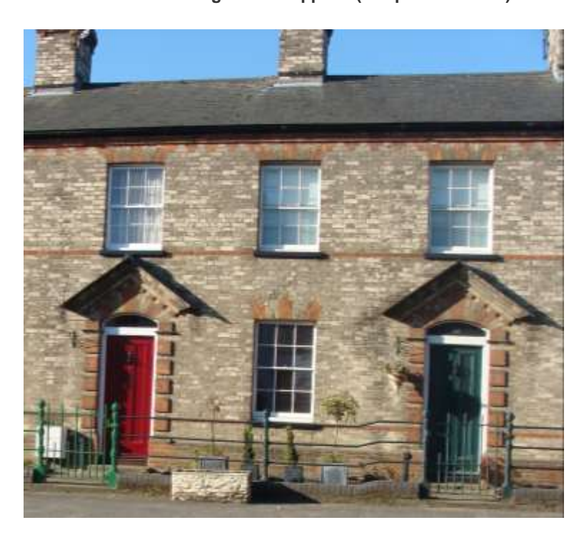
Picture 4. A terrace not local to Thundridge and Wadesmill: the purpose of this photo is to illustrate the importance of design detail. The retention of detail of an historic listed terrace depends on simple repetitive detailing, including original windows and doors. Expression of ownership can be provided by painting doors different colours. Compare with previous picture.

5.11. Wadesmill Bridge over River Rib in middle of village - Grade II. Road bridge over River Rib. 1824-5 by Mr. Robson for Cheshunt Turnpike Trustees: contractors Brough & Smith of London. Grey/yellow brick with grey granite columns, string course, and haunched beams