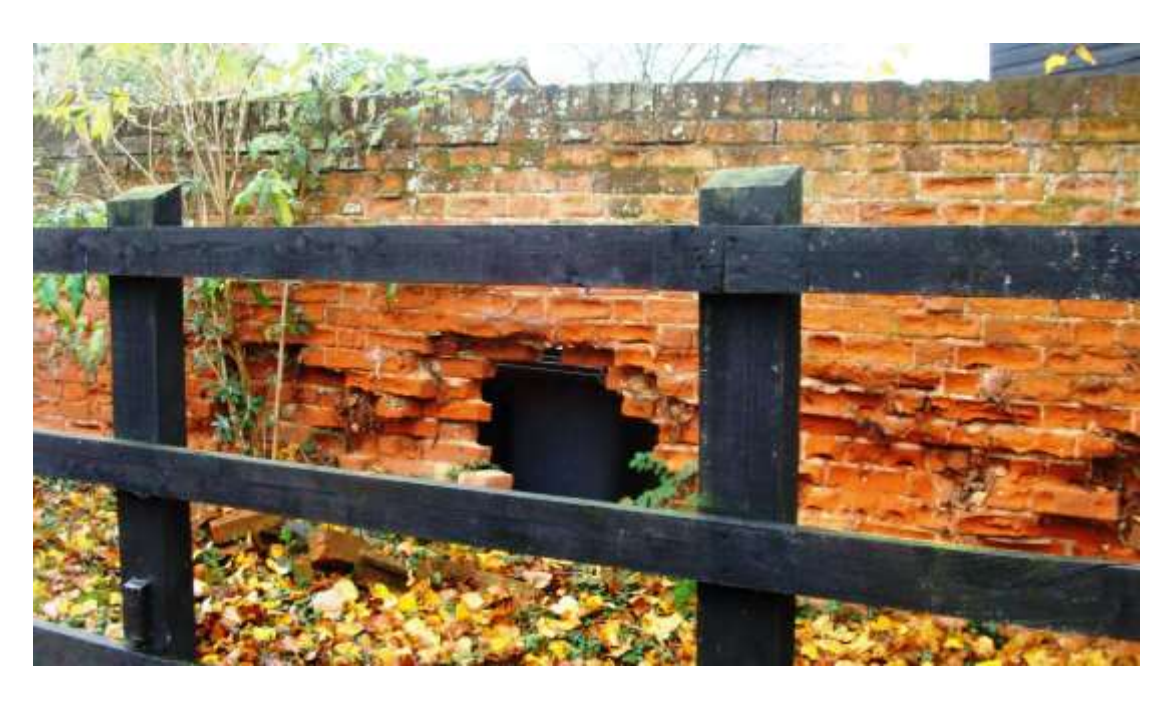
Picture 17. 19th century wall at Rennesley Farmhouse in urgent need of repair. The potential of grant assistance from EHDC exists.

5.29. Iron Gates near South Lodge. Large pair of decorative metal gates supported by substantial piers each surmounted by ball finials. Provides interesting historic feature on drive entrance accessing Youngsbury Grade II* historic Park and Garden.