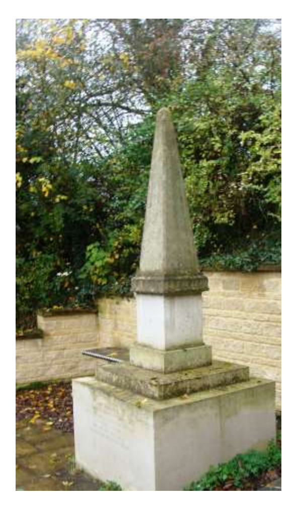
Picture 2. The Clarkson Memorial, erected 1879, commemorating Thomas Clarkson's contribution to the abolition of slavery.

5.10. Nos. 20 to 29 Cambridge Road - Grade II. Terrace of houses. Late 18th century. Grey/yellow brick with old red tile roof, hipped at ends. 2-storeys. Each house has a door remote from the shared chimney and one front window to each floor. 2-light casement windows set flush. Doors and windows on each floor have segmental arches.