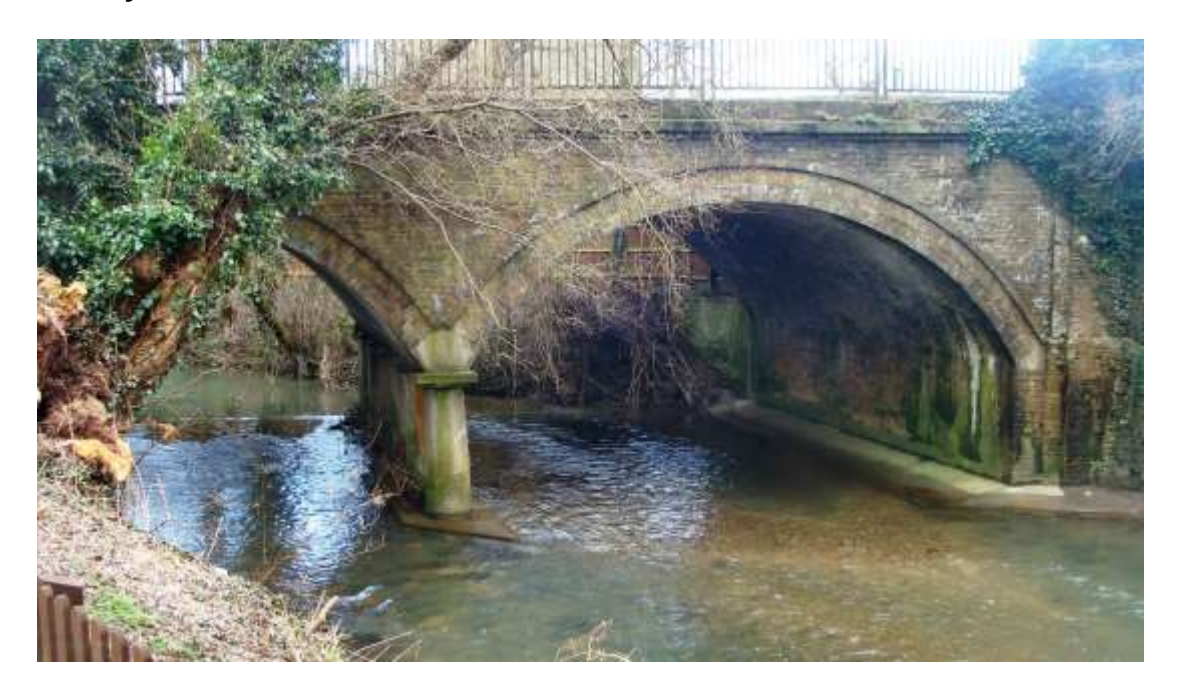
Picture 5. Listed road bridge over River Rib. Considered to be very fine in some of its detailing.

and reused limestone copings. 2 semi-circular arches of 25 foot span, resting centrally on a row of 6 unfluted Greek Doric columns, each of 2 drums of grey granite, with an angled haunching of granite at the springing of each arch. The chamfered stone coping and pier cappings were probably reused from the 1767 repairs to the previous bridge. The original iron latticed side rails to the central spans were replaced to a simpler pattern after being damaged in 1966. An unusual Neo-Classical design. Branch Johnson notes that it is one of the best bridges in the county.