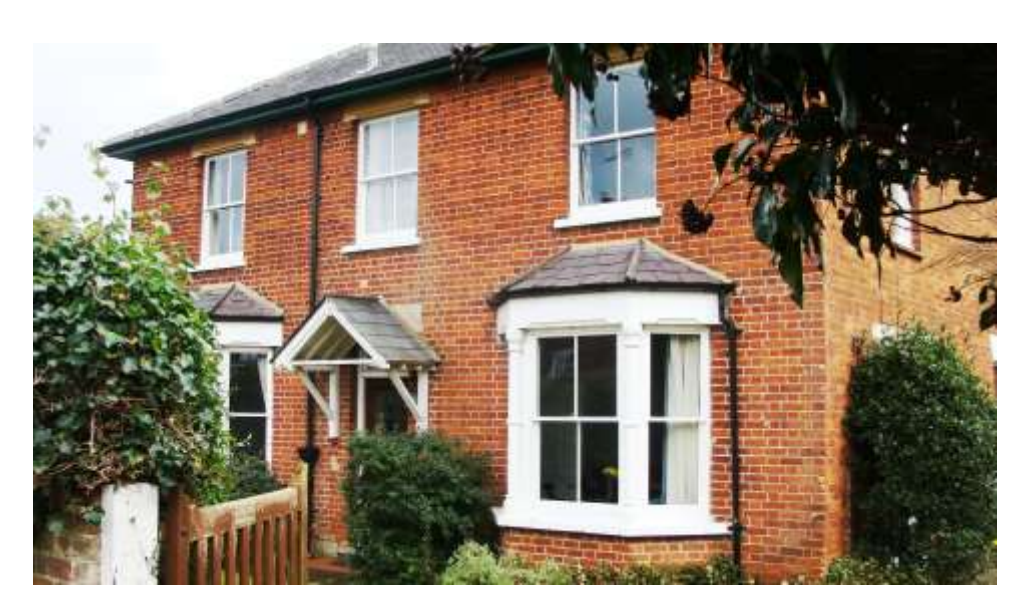
Picture 10. The Limes Ermine Street - a late 19th century detached residence worthy of retention.