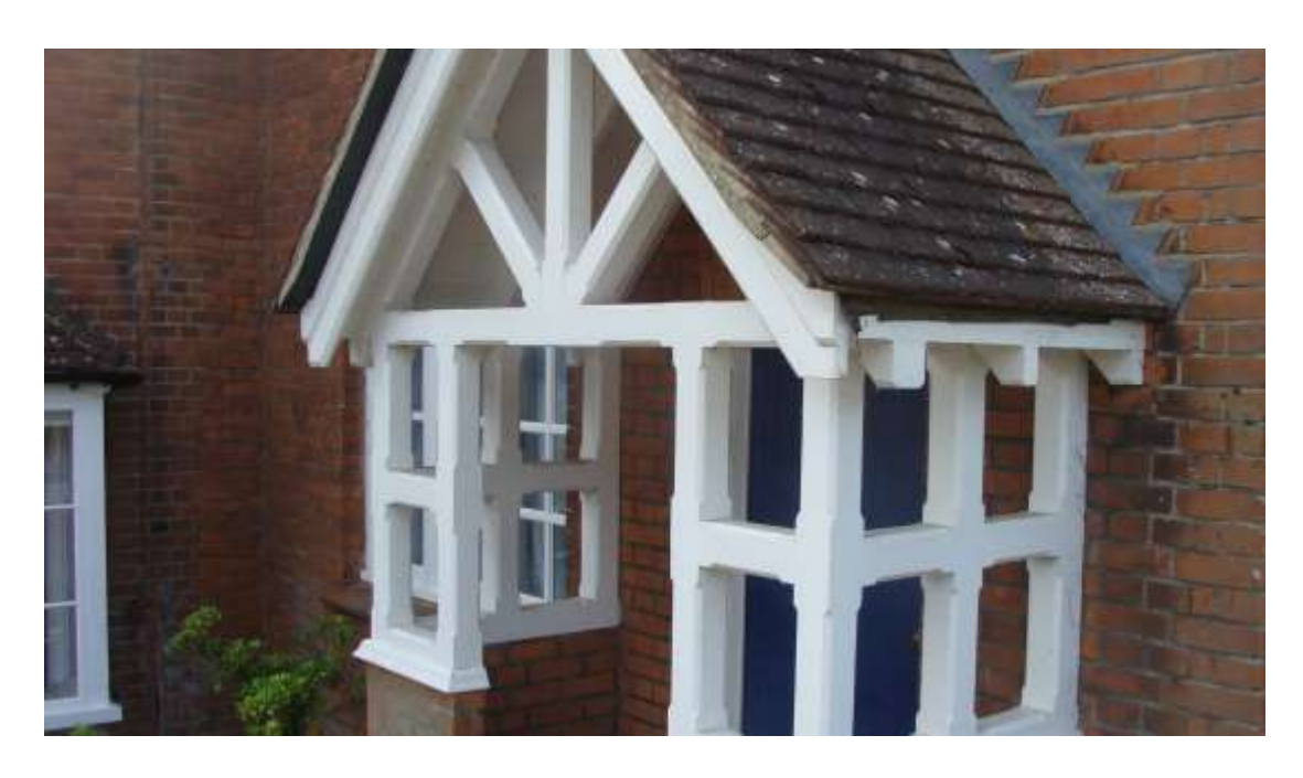
Picture 14. Attractive decorative wooden detailing to Thundridge Village store/no. 39.

5.24. Trinity Barn and associated outbuildings. The main building is two storey weather boarded with slate roof. Associated buildings are single storey with tiled and slate roofs. Assumed to have previously been part of Rennesley Farm complex (although not processed as being curtilage listed). A well detailed and sympathetic conversion. The brickwork to one ancillary building believed to form part of the complex needs repair.