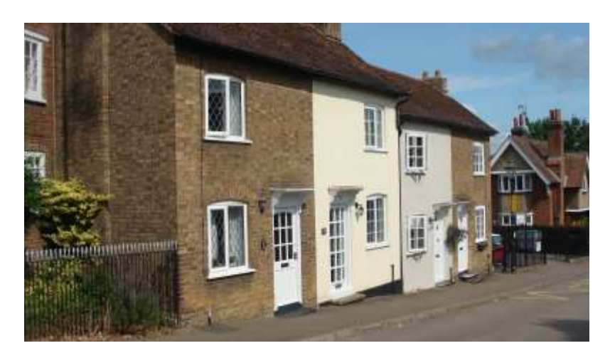
Picture 11. Nos.17-23 Ermine Street - had the various treatments of surfaces, windows and doors been coordinated the result would have been more pleasing.

5.20. Nos.17-23 Ermine Street. Group of late 19th/ early 20th century cottages of brick construction with tiled roofs and chimneys, some of which are tall, with pots. Properties have been individually modified where a variety of modern doors and windows have created an overall uncoordinated design solution. No. 23 retains original windows.