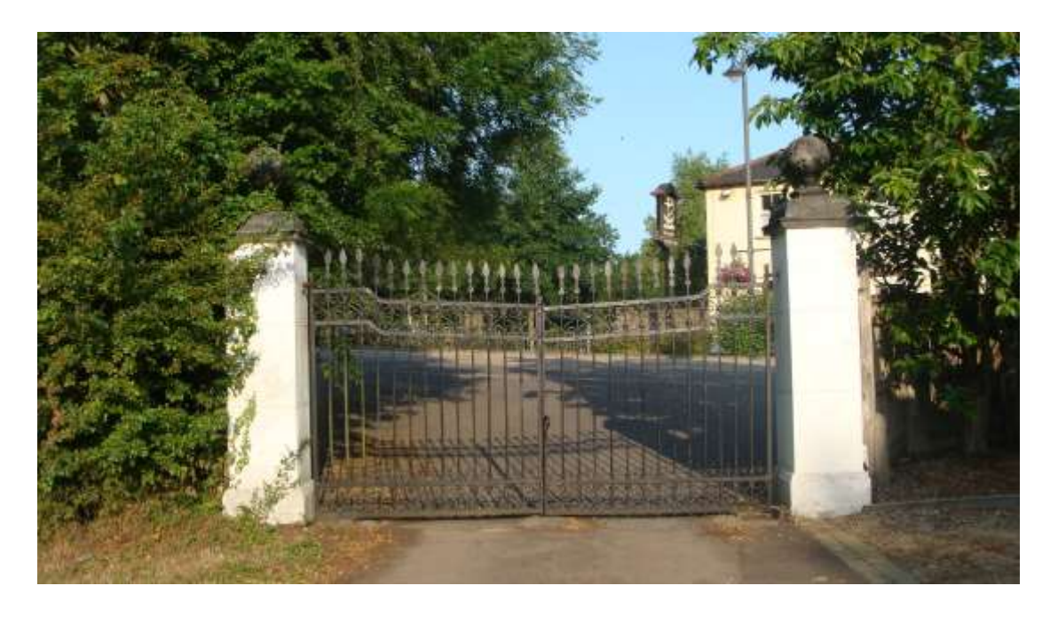
Picture 18. Decorative iron gates and piers on entrance drive to Youngsbury - a grade II* historic Park and Garden.

5.29. Iron Gates near South Lodge. Large pair of decorative metal gates supported by substantial piers each surmounted by ball finials. Provides interesting historic feature on drive entrance accessing Youngsbury Grade II* historic Park and Garden.