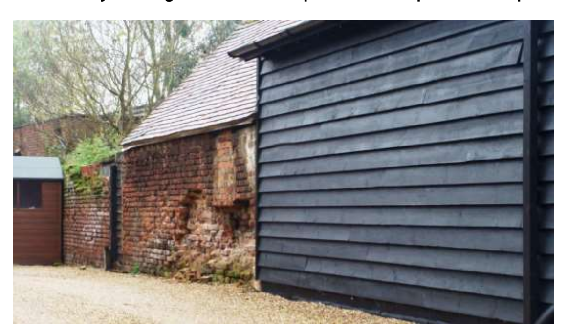
Picture 15. Ancillary building assumed to form part of Trinity Barn complex whose brickwork is in need of repair.

5.24. Trinity Barn and associated outbuildings. The main building is two storey weather boarded with slate roof. Associated buildings are single storey with tiled and slate roofs. Assumed to have previously been part of Rennesley Farm complex (although not processed as being curtilage listed). A well detailed and sympathetic conversion. The brickwork to one ancillary building believed to form part of the complex needs repair.