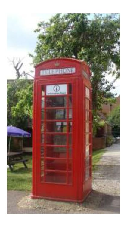
Picture 19. K6 Telephone kiosk, well maintained and in good condition, now an information point.

5.31. War Memorial. Stone tapered octagonal shaft surmounted by cross on stepped octagonal base commemorating those from Thundridge who gave their lives in both World wars.