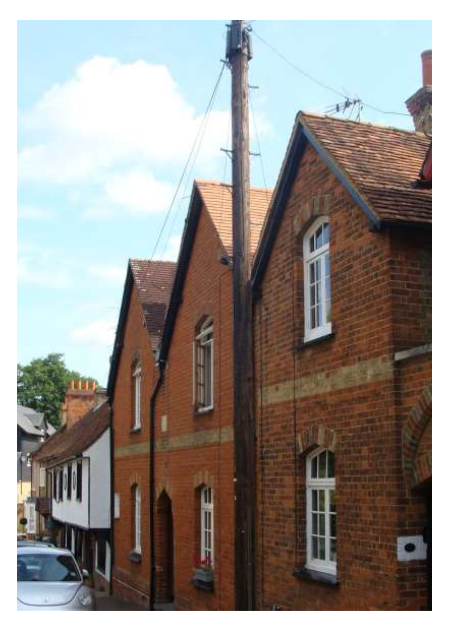
Picture 25. Utility poles detract from the high quality of the Conservation Area in this location on Ermine Street. The potential of resolving the situation could be explores with the utility company.

5.43. Opportunities to secure improvements. Discuss potential of improving area of open land to east of commercial premises north of Rennesley Farm. Repair curtilage wall at Renessley Farm. Discuss potential of improving frontage to no. 8 Ermine Street. The Parish Council may wish to approach the utility company and explore the potential of reducing the visual impact of selected utility poles at Ermine Street.