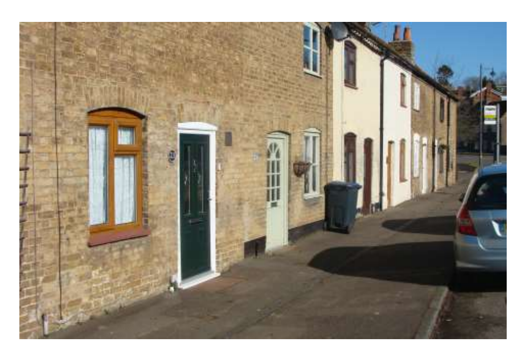
Picture 3. 20-29 Cambridge Road. Terrace of Listed Buildings dating from late 18th century. Whilst doors and windows are in original openings, a more pleasing result would have been achieved had common designs been applied (see picture below).