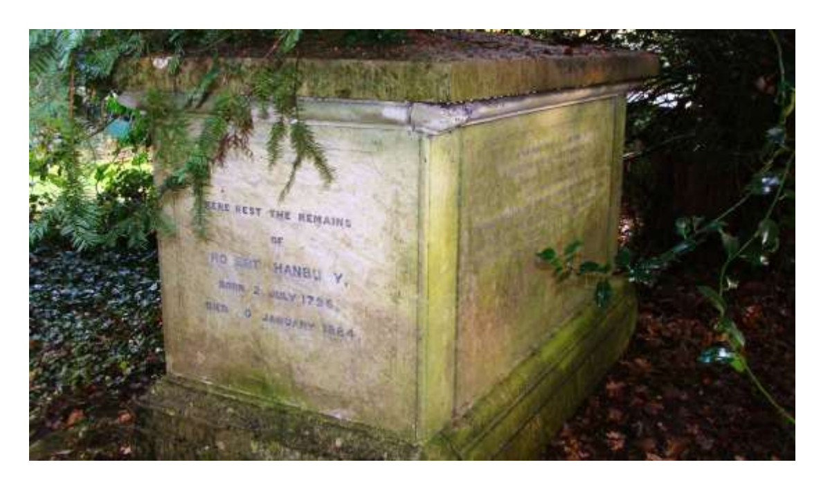
Picture 21. Vault of Robert Hanbury and family who built and endowed the church.

5.33. <u>Important Open Spaces.</u> The area bounded by the access running due east from South Lodge and extending to the River Rib is an enclosed area of low lying arable land. Enclosing it on its eastern boundary is the bottom of the landscaped embankment to the A10. Within this area are several groups of trees. Although an agricultural parcel of land it does not form part of the open countryside due to its enclosure. Most importantly it provides an important setting to the historic core to the north dominated by the church tower on the sky line.