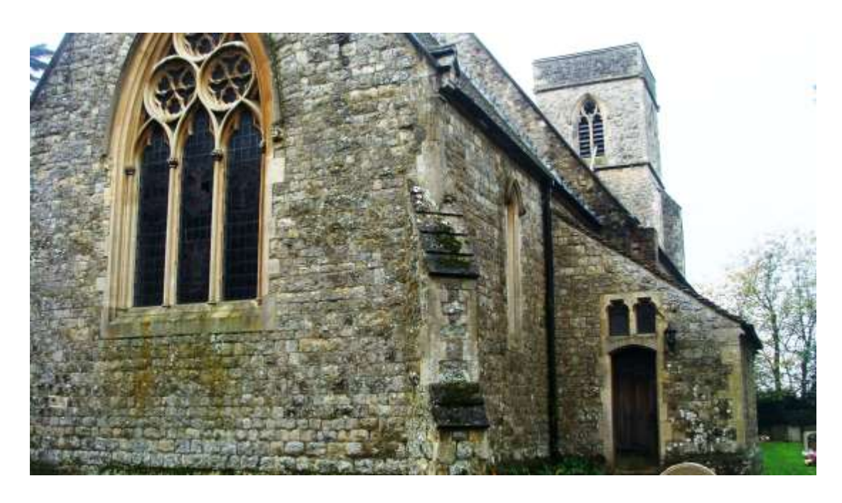
Picture 7. Church of St Mary's built in 1853 to replace the old medieval church in the valley that had fallen into disrepair by the mid 19th century. Certain monuments. The Royal Arms and the bells were taken from the old church and installed here in the new one.

5.14. Important buildings within the curtilages of Listed Building. The issue of deciding whether or not a building is 'curtilage listed' can be problematic and there is no exact legal definition of a building's curtilage. The main tests relate to the physical layout of the land surrounding the main building/s at the date of listing, the physical layout and functional relationship of structures to each other; ownership, past and present and use or function, past and present. Structures need to be ancillary or subordinate to the main Listed Building and form part of the land and not be historically independent. Protection is granted to such objects or structures within the curtilage of a Listed Building if they were built prior to July 1, 1948. In determining the extent of a Listed Building and its curtilage, a key assessment will be to examine the situation at the time of listing.