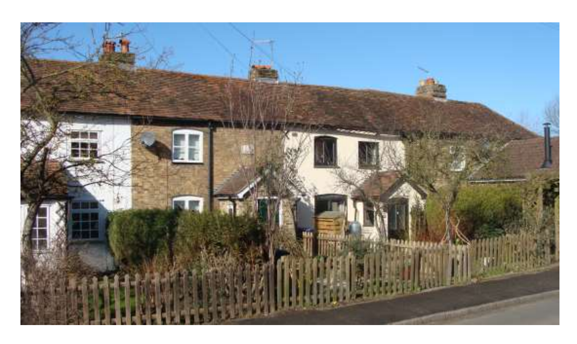
Picture 6. 31 Cambridge Road. The centrally located house with the plaque is listed. Others in the terrace described as having been 'altered' demonstrate the conflicting problems of resolving a good environmental solution to small historic properties versus providing additional accommodation.

5.13. Parish Church of St Mary Grade II. 1853 by Benjamin Ferrey for Robert Hanbury. Squared coursed Kentish ragstone with freestone dressings and red tiled roof with ridge cresting of pierced trefoiled tiles. Early English style, consisting of a chancel, nave, south timber porch and tall, buttressed western tower with octagonal south west projecting stair turret carried higher than the unbattlemented parapet. Late 18th century mural monuments. 19th century mural monuments by Bedford and Theed (Caroline Hanbury died 1883: R C Hanbury 1867). Victorian stained glass. Commanding position high on a hillside overlooking the valley and village.