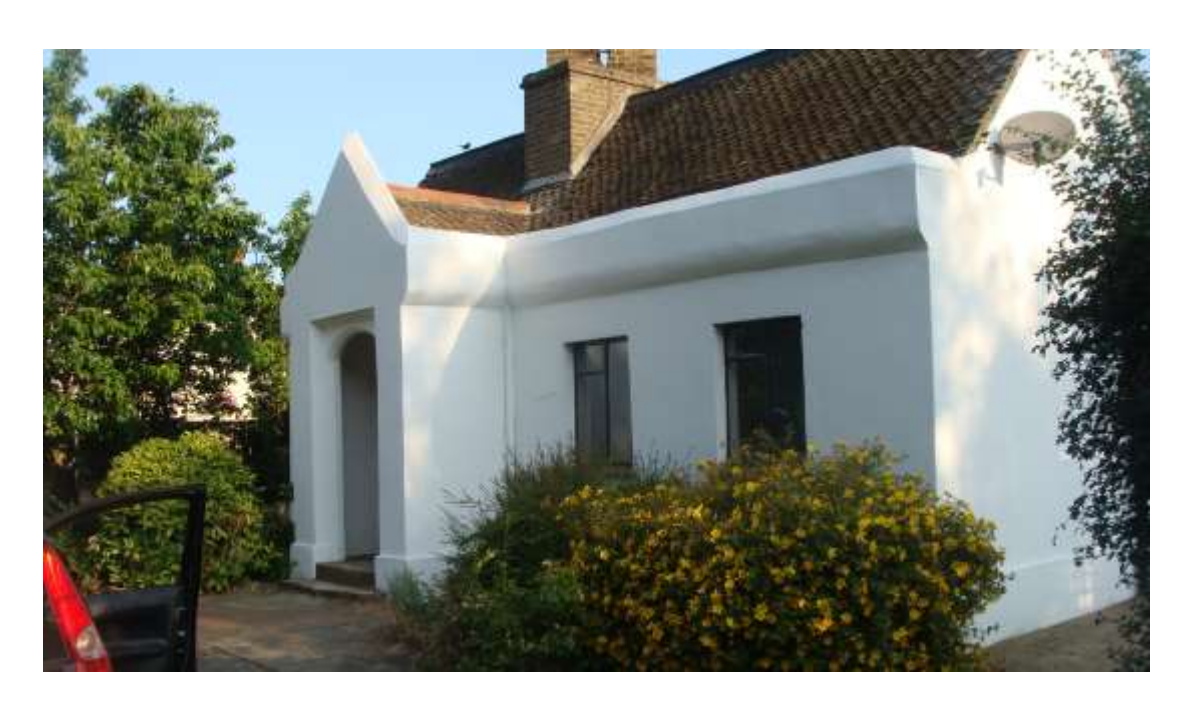
Picture 8. South Lodge - single storey rendered Lodge, tiled roof slate ridge and later metal windows. Whatever its status in law (i.e. curtilage listed or not) it is a building that is worthy of retention.

5.16. Other non listed buildings that make an important architectural or historic contribution. This Appraisal identifies other buildings of high quality that are not listed but that should be retained. These principally date from the late 19th/early 20<sup>th</sup> century and are an important to the environmental quality of the Conservation Area. Any Important architectural features they possess and worthy of retention are identified.