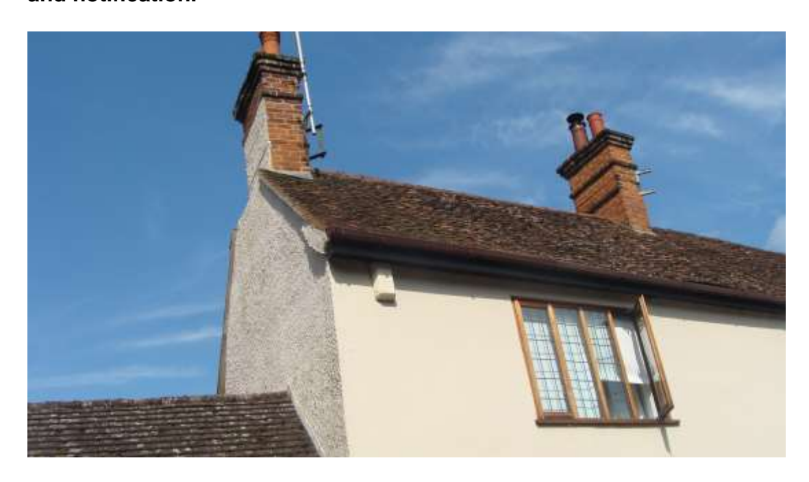
Picture 12. Good quality roofscape on strategic corner location of Ermine Street and Old Church Lane that should be retained.

5.21. Nos. 35-37 Ermine Street/ corner of Old Church Lane. Two storey render with old tiled roof and 2 no. chimneys with pots. Modern windows. The roofscape of this group adds to the quality of this strategic corner location. An Article 4 Direction to provide protection for selected features may be appropriate subject to further consideration and notification.