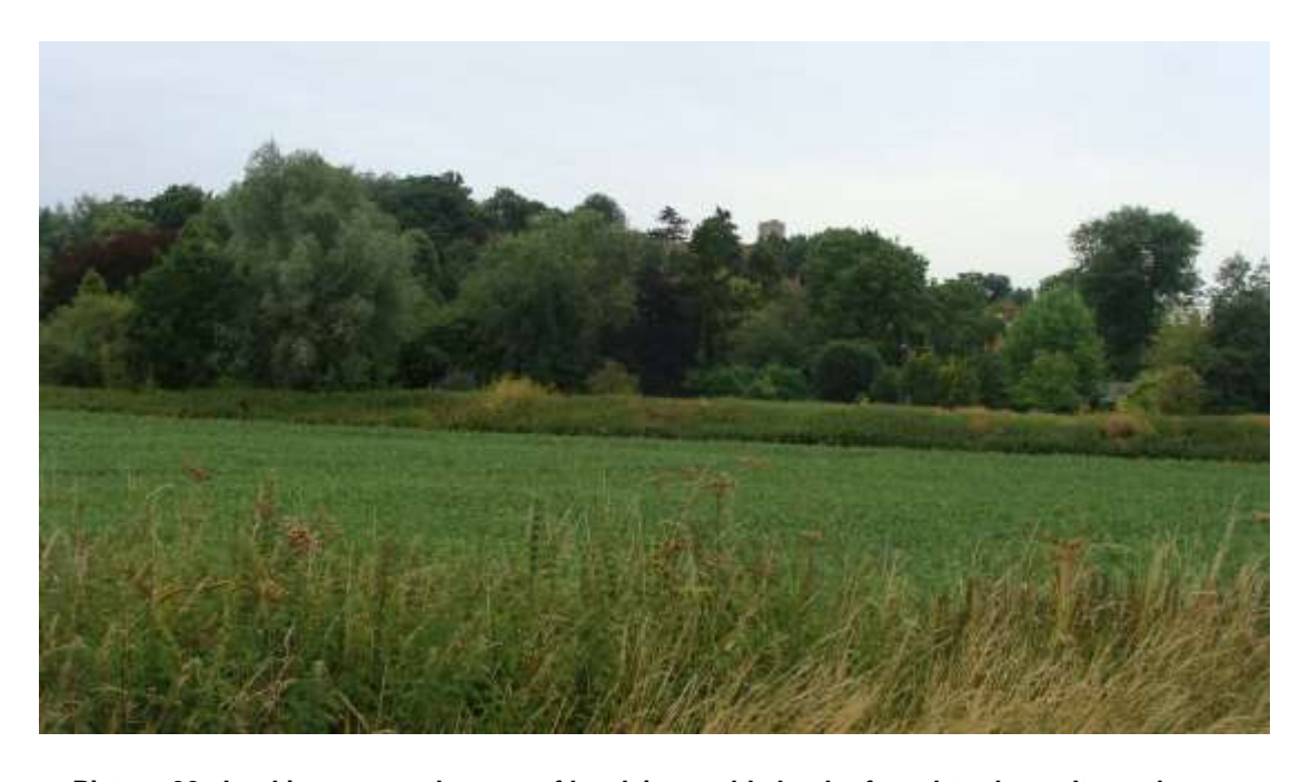
Picture 22. Looking across the area of low lying arable land referred to above. Its enclosure means it does not form part of the wider open countryside beyond and it provides an important buffer area between Wadesmill and Thundridge. The Victorian church tower at Thundridge can just be seen in this photograph above the tree line.

5.33. <u>Important Open Spaces.</u> The area bounded by the access running due east from South Lodge and extending to the River Rib is an enclosed area of low lying arable land. Enclosing it on its eastern boundary is the bottom of the landscaped embankment to the A10. Within this area are several groups of trees. Although an agricultural parcel of land it does not form part of the open countryside due to its enclosure. Most importantly it provides an important setting to the historic core to the north dominated by the church tower on the sky line.