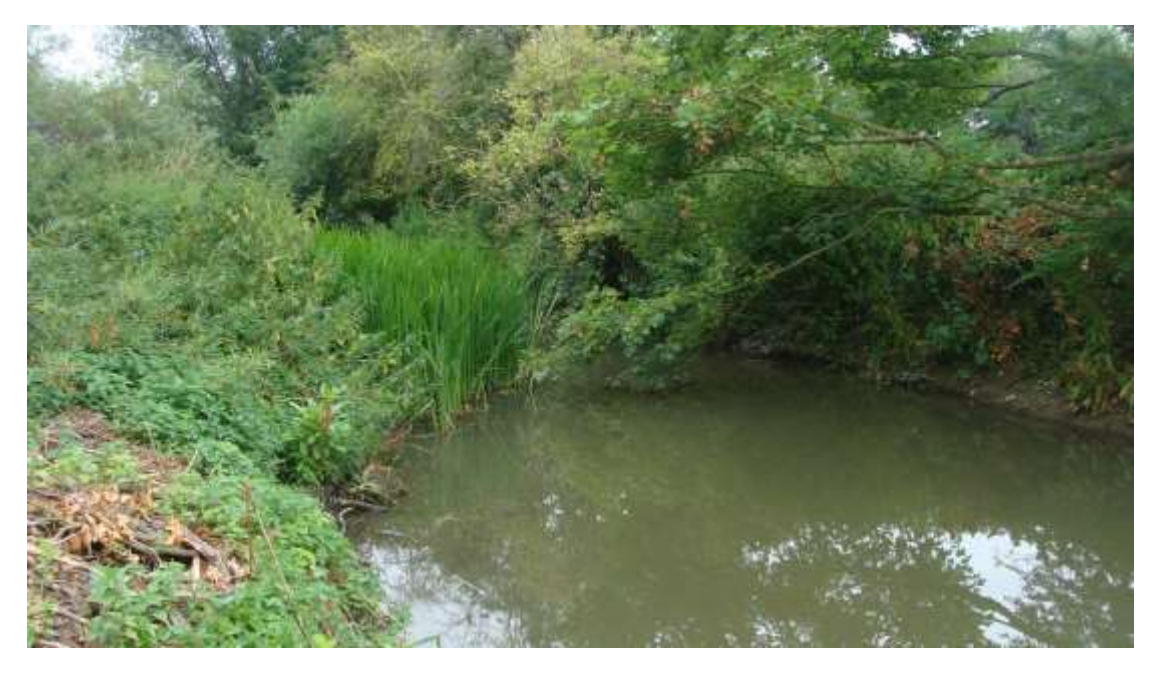
Picture 24. The River Rib is an important environmental feature adding significantly to the quality of the Conservation Area. Its character varies. This photograph was taken at a location near to Old Church Lane in the east.

5.35. <u>Important Water features.</u> The River Rib in the valley bottom is an important environmental feature.