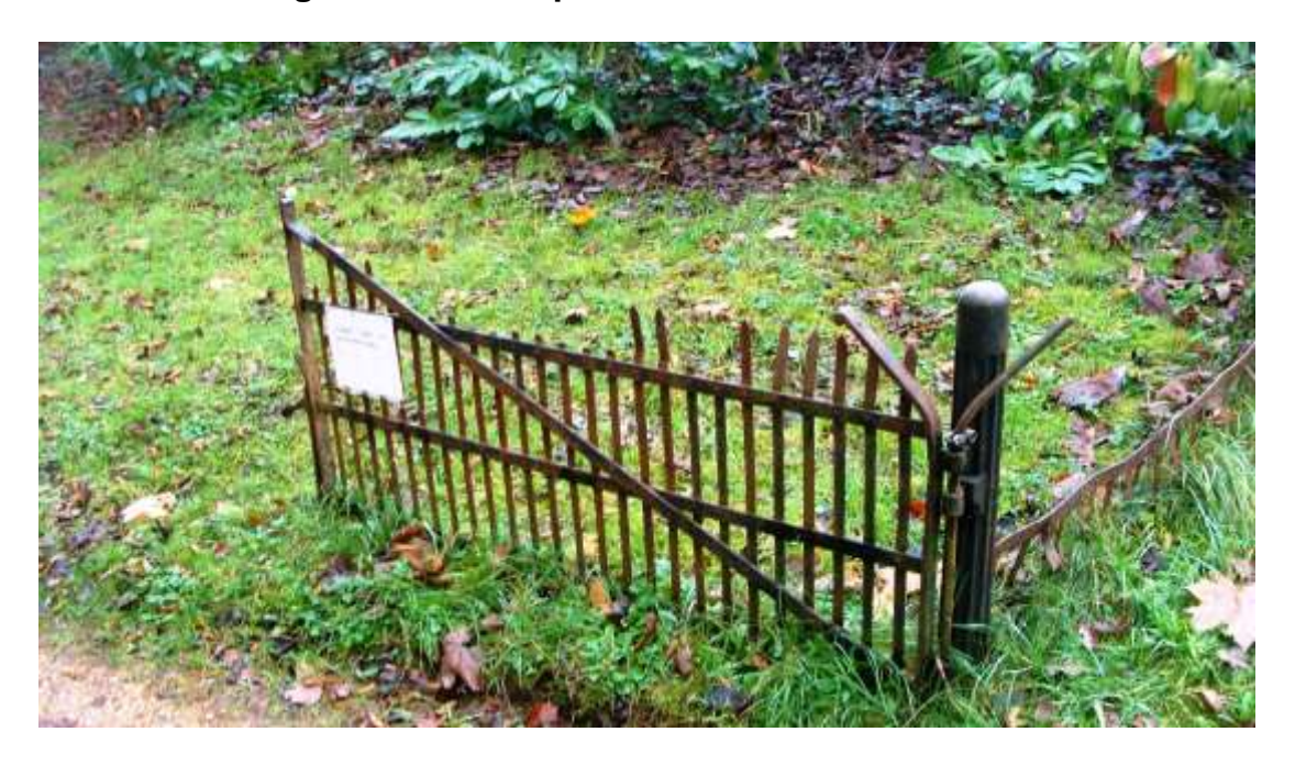
Picture 16. Curious iron gates probably contemporary with the church in need of repair - a challenge but nevertheless possible.

5.26. Wall surrounding churchyard constructed of brick with slate triangular section capping detail. Also curious iron gates and associated low metal railings in need of repair.