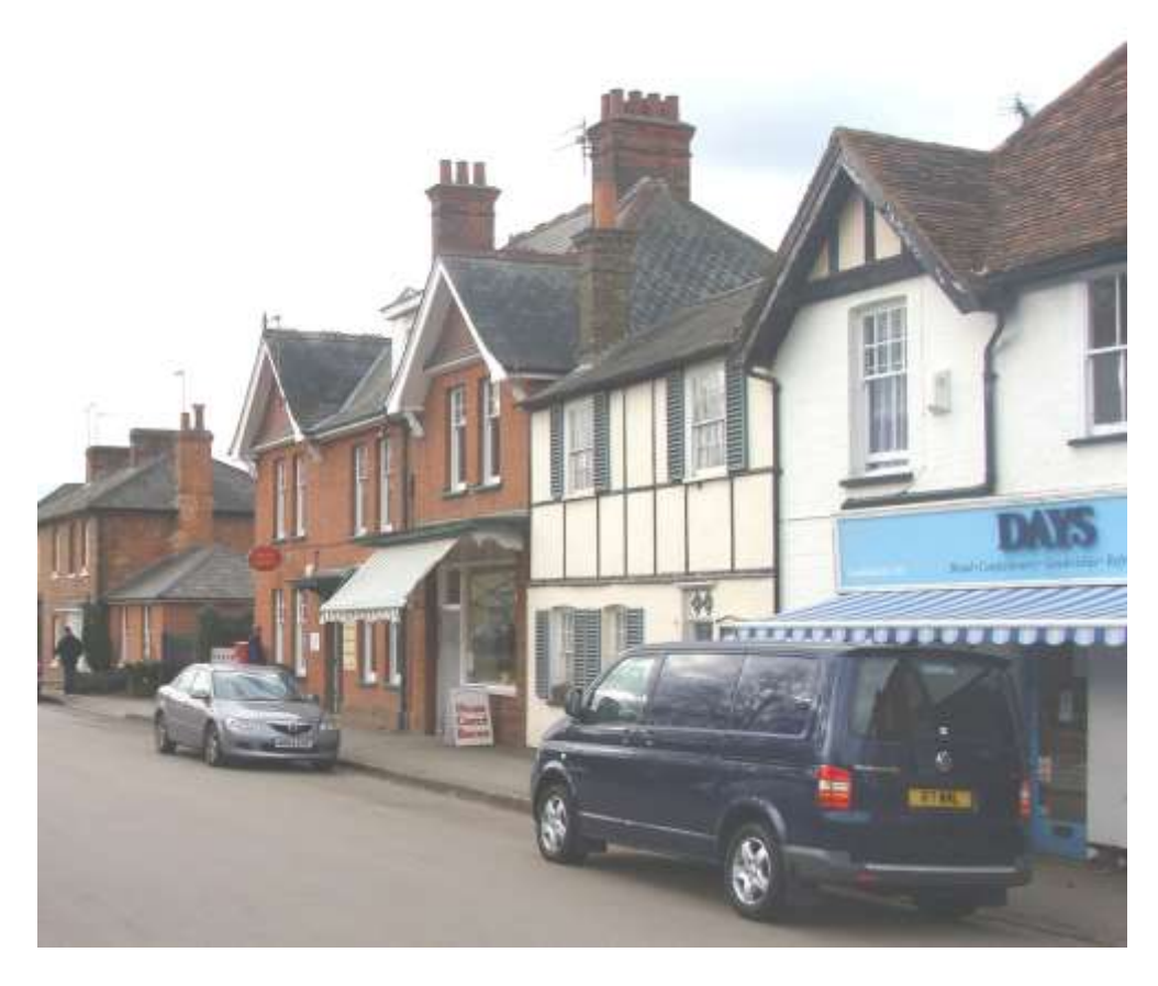
Picture 5 – Group of interesting non-listed properties, High Street, worthy of protection and retention.

6.18. Nos.15-19 High Street, east side. 19<sup>th</sup> century 2 storey gault brick group of cottages with slate roof and 3 no. distinctive decorative chimneys with original pots. Date plaque inscribed E Knight 1891. Some original windows remain. Despite other window replacements and other alterations, enough of historic and simple architectural qualities remain to warrant inclusion. An Article 4 Direction to provide protection for chimney features may be appropriate subject to further consideration and notification.