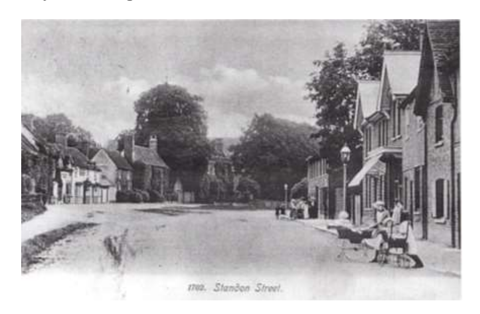
Picture 1 – High Street, probably early 20<sup>th</sup> century.

Interesting features noted on this map include the railway line and station; a Windmill to the south of Hadham Road, opposite the Almshouses; a school for Boys and Girls at Knights Court; the Paper Mill at Paper Mill Lane; a Corn Mill at Mill End; a brewery at Mill End; a large building called The Vicarage opposite New Street Farm on New Street (now Kents Lane) and a Smithy on the High Street.