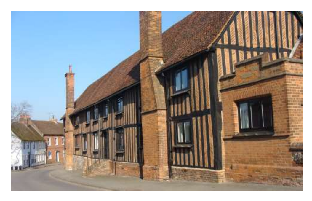
Picture 4 - Knights Court dating from 16<sup>th</sup> century, re-fronted in 19<sup>th</sup> century.

6.5. Individually Listed Buildings. In total there are approximately 30 individually listed buildings within this area, of which 22 are in the High Street, 5 in Hadham Road and 2 at the junction of Paper Mill Lane. Of particular importance is the group clustered around the church. The latter with its detached tower, described as being 'unique in the County', is listed Grade I. Close by is the Grade II* Knights Court, possibly a manorial courthouse dating from the 16<sup>th</sup> century or earlier with its steep tiled roof and continuous jetty on north side facing the churchyard. Also in this general area is 59 High Street (Standon House), an impressive Grade II* Queen Anne House overlooking the Market Place of the former Borough. The remaining buildings generally date from the 17<sup>th</sup> century with some having been re-modeled at later dates. In this respect Church End Cottages which date from this period have been 'Gothicized' during the 19<sup>th</sup> century and form a particularly attractive picturesque group.