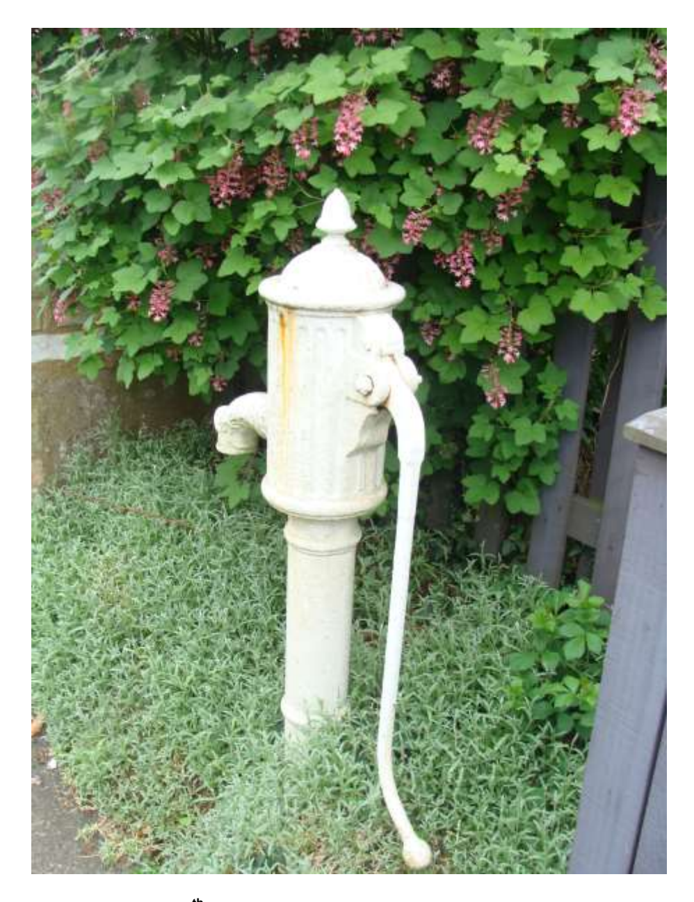
Picture 12 – One of 2 no. 19<sup>th</sup> century cast iron Pumps, Stortford Road, that are considered worthy of being 'Listed'.