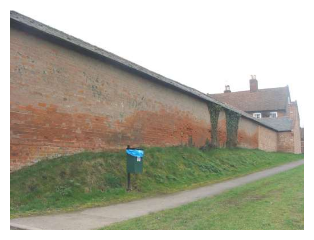
Picture 9 – 19<sup>th</sup> century agricultural barn, important element in approach to village, sensitively rebuilt in part.

6.64. Other distinctive features that make an important architectural or historic contribution. The following walls add to the character of this part of the Conservation Area - 19th century gault brick wall of Flemish bond in excess of 1m in height with quality capping stones by Doulton and Company. Protected from demolition without prior consent virtue of height and within curtilage of the Bell PH, a Listed Building.