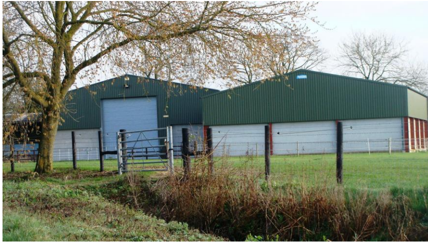
Picture 34. Modern agricultural barns of no architectural merit or historical importance highly visible to the south east of Reedings.

(c) Exclude Muncher's Green and open countryside to the west of Fir Tree Farm. Forms part of the open countryside.