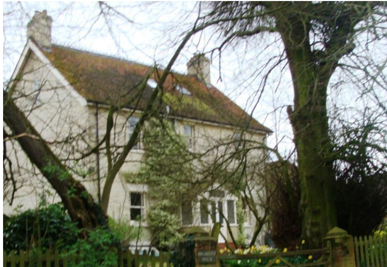
Picture 45. Highbury House dating from late 19th century and worthy of retention.

5.92. Highbury House. Of late 19th century date. Yellow brick construction, two storeys in height with tiled roof and decorative ridge detailing; 2 No. chimneys. Simple barge board detailing, vertical sliding sash windows. An Article 4 Direction to provide protection for selected features may be appropriate subject to further consideration and notification.