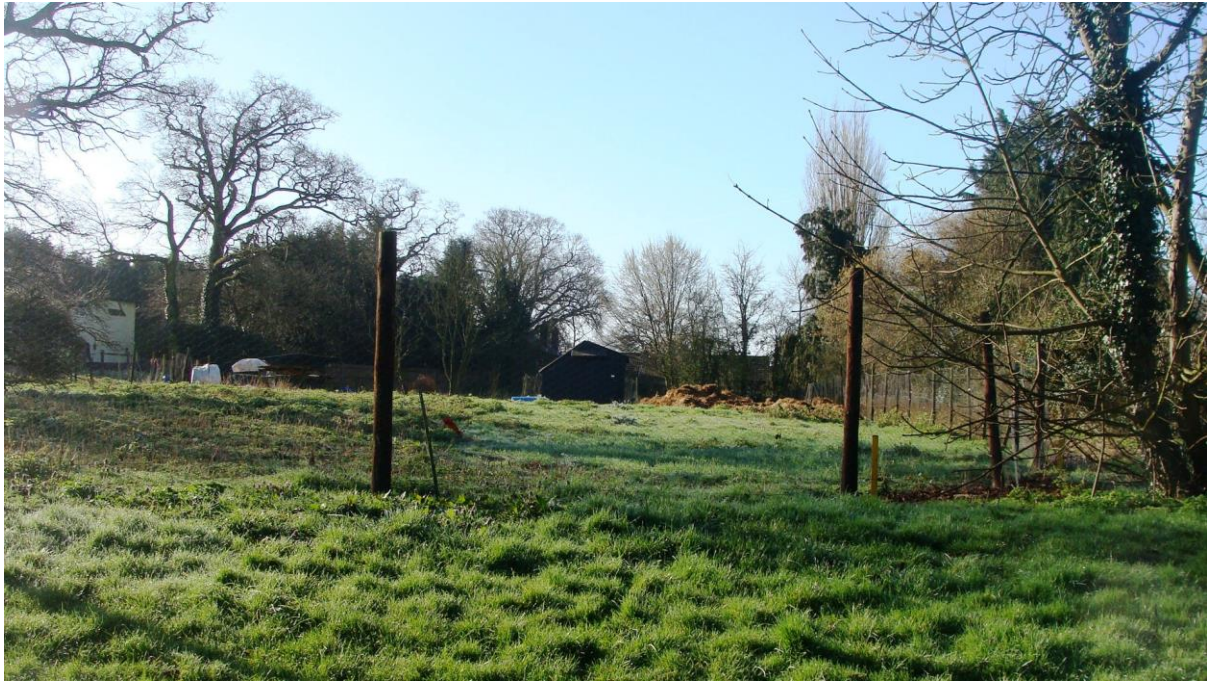
Picture 15. Strategically located open site to west of The Homestall which is important to retain as such.

5.31. Wildlife site. Within Ardeley there is one Local Wildlife Site identified by the Wildlife Sites Inventory for East Herts 2013. This is Ardeley Churchyard (ref. 23/005) which is described as neutral grassland with a number of indicators of old grassland with planted trees and scrub and habitat diversity.