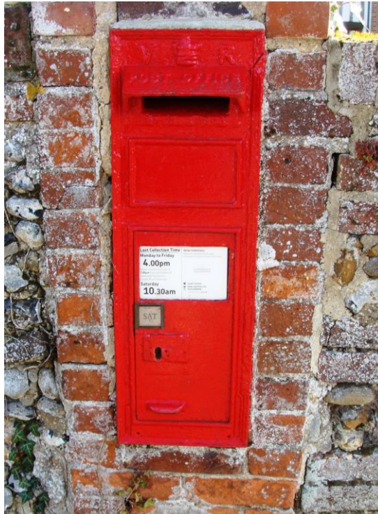
Picture 46. Victorian wall letter box in curtilage listed wall. Not many of these remain.

5.96. Important Open Spaces. The spaces identified below are most important and should be preserved.