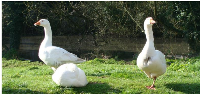
Picture 48. The pond adjacent to Highbury Farm adds diversity and interest to this rural location.

5.102. Water features. The pond adjacent to Highbury Farm is an important feature in the street scene and most worthy of retention. A pond of similar shape is interpreted as existing on late 19th century mapping.