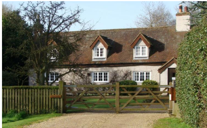
Picture 40. Peartrees Listed Grade II - dates from early 16th century.

5.81. Peartrees - Grade II. Early 16th century open hall house, floor and central chimney inserted in hall in late 17th century (wood block with 'WN. RS 1673' now loose in house may date these). Timber frame roughcast with steep roof.