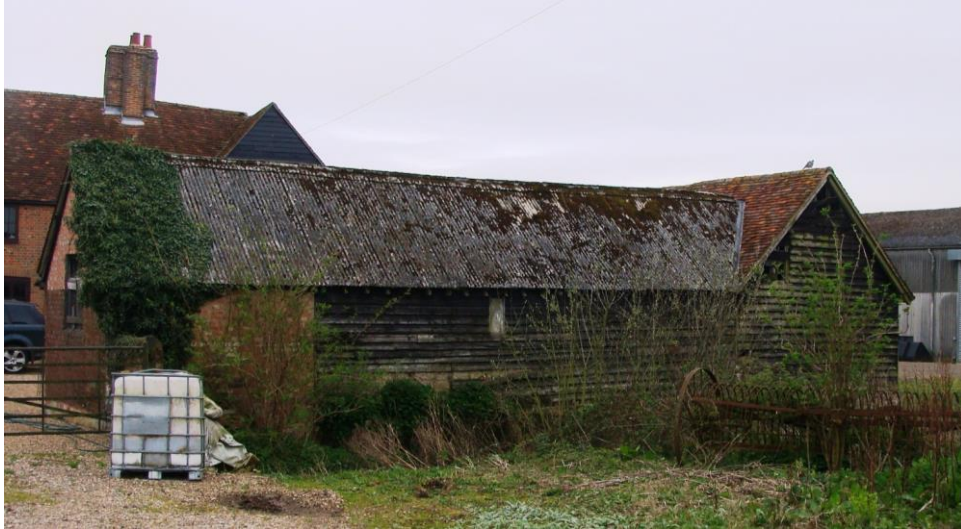
Picture 30. Building to front of Listed Fir Tree Farmhouse. Securing its improvement would represent a significant gain.

5.57. Other non listed buildings that make an important architectural or historic contribution. No such buildings have been identified. Although a few representatives from the late 19th/early 20th century exist, these have been altered to a degree and no longer retain sufficient quality to be included within this category.