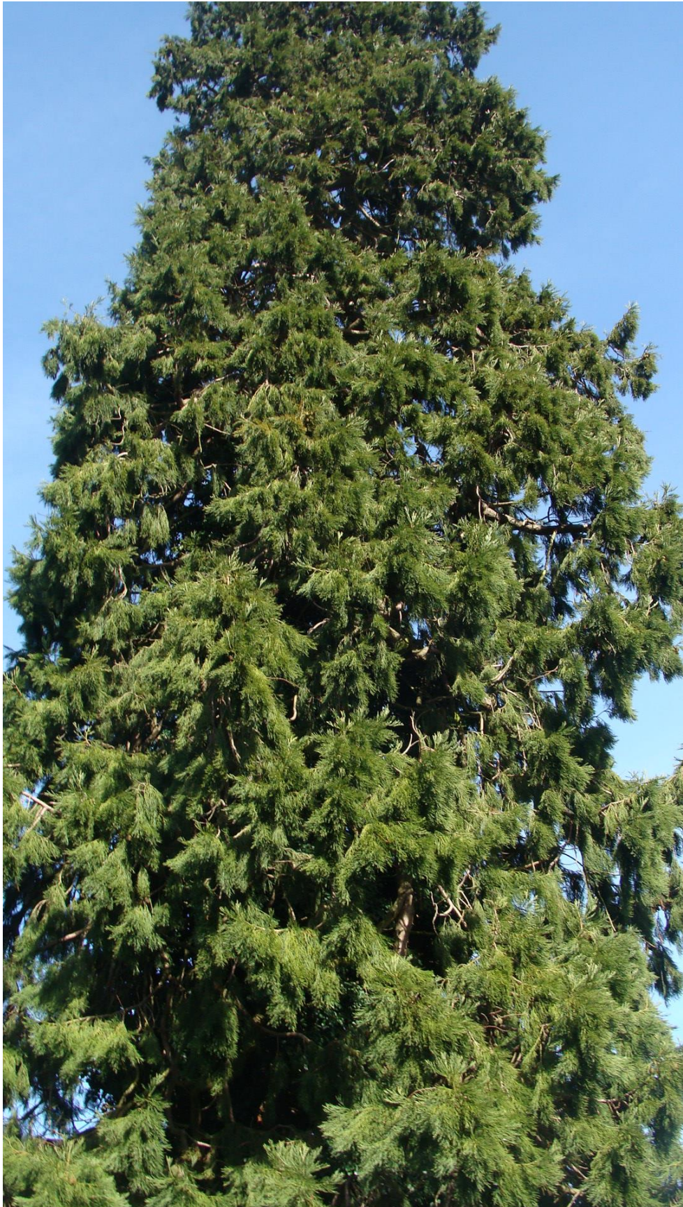
Picture 16. Magnificent tree in churchyard - 'Mammoth Tree' ( Sequoiadendron giganteum ).