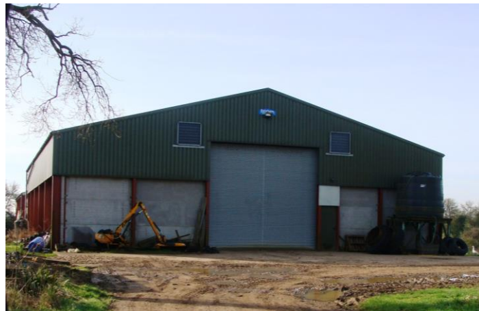
Picture 52. Modern agricultural complex south of Cherry Farm, one of several similar modern agricultural complexes removed from the conservation area. Clearly such a building has no architectural merit or historic interest.

(b) exclude a tract of countryside to the west of Coates Manor Farm and north of Spring Grange.