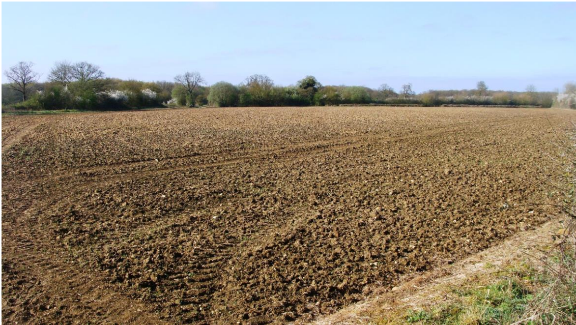
Picture 35. Muncher's Green used to be of some historic interest but now is in arable agricultural use and clearly forming part of the open countryside and wider landscape.

(c) Exclude Muncher's Green and open countryside to the west of Fir Tree Farm. Forms part of the open countryside.