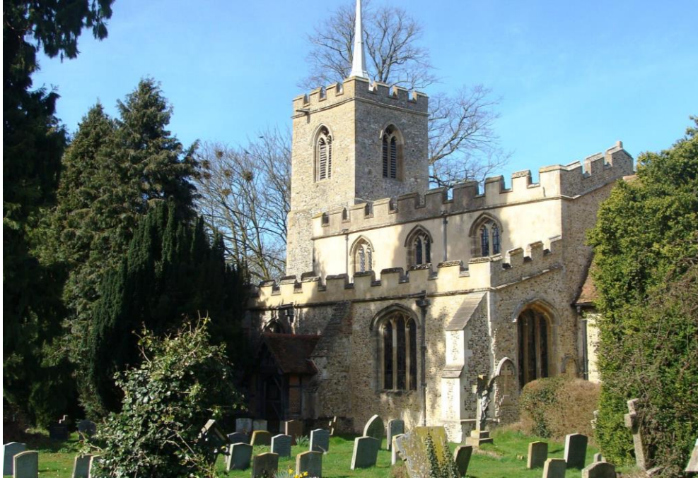
Picture 2. Church of St. Lawrence - The tower and its Hertfordshire spike together with wealth of gravestones and magnificent trees makes an important environmental and historic contribution to the conservation area.

5.8. War Memorial - Grade II. Circa 1919. Possibly by F. C. Eden. Stucco with limestone dressings, inscribed Portland stone panels, battered knapped flint base with red brick banding and quoins, and a projecting steep old red tile gabled roof. Tall gabled memorial in the form of a wayside shrine with a half-size standing figure of St George in a large round-headed niche. Iron cross on gable. Local sources advise the figure of St George is a replacement following the theft of the original. Removal of ivy and selected vegetation would be advantageous.