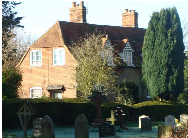
Picture 9. One of three pairs of mid 20th century semi detached houses displaying good proportions and use of traditional features and materials.

5.24. The Homestall. Two storey painted brick to front with slate roof and prominent chimney. Some early windows. Access limited thus paucity of information. An Article 4 Direction to provide protection for selected features may be appropriate subject to further consideration and notification.