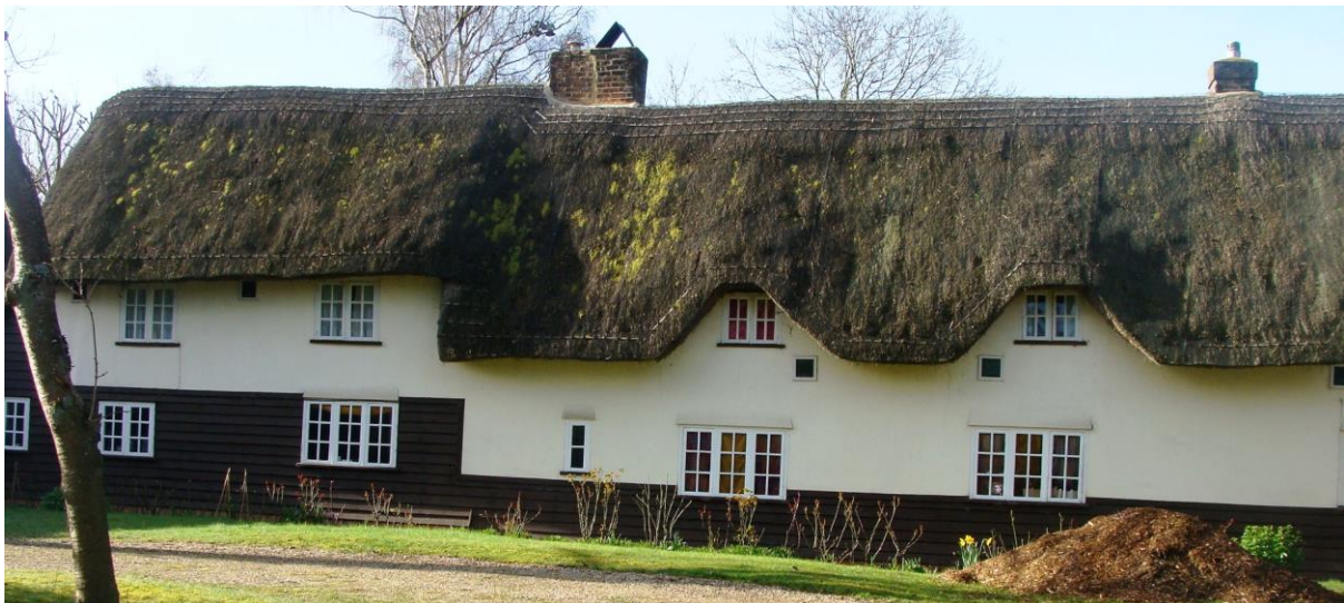
Picture 41. Orchard Cottage a fine grade II 18th century or earlier property with steeply sloping thatched roof.

5.82. Orchard Cottage - Grade II. 18th century or earlier, east part probably 19th century. Timber frame roughcast on stucco plinth and weather boarded apron. Steep pitched thatch roof with eyebrow dormers.