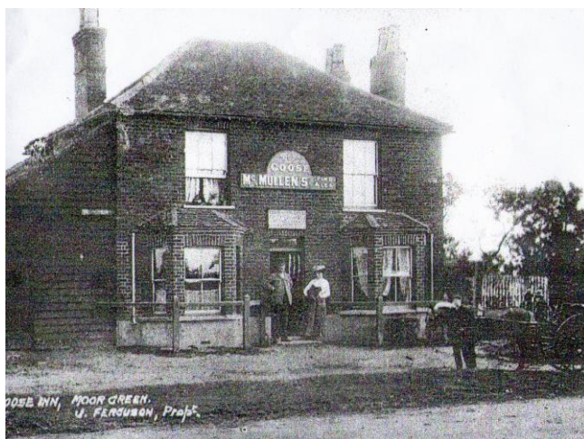
Pictures 26-27. Upper picture shows former Goose PH as it currently is. Lower picture shows The Goose PH in its prime as a PH probably in the late 19th/early 20th century. The fieldworker was advised it closed in 1980. Regrettably its change to residential has involved the loss of a number of early features.

5.44. Individually Listed Buildings. There are 6 listed buildings/groups within the conservation area at Moor Green. Of this total, 3 date from the 17th century, 2 from the 19th century and 1 from the 18th century.