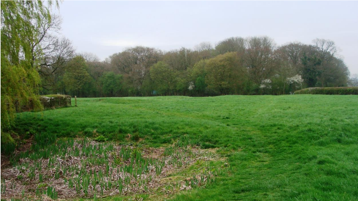
Picture 29. The Scheduled Ancient Monument site of Moor Hall. Note considerable undulations in the grassland. The designated site extends into the woodland beyond (the latter is also part of the Site of Special Scientific Interest).

the same alignment which are interpreted as belonging to an associated enclosure. The monument is identified as the manorial site of Moor Hall which is recorded from the late 13th century when it was held as part of the main manor of Ardeley. A much abbreviated description based on Historic England's entry. The site is undulating demonstrating the presence of former buildings. The accompanying map of Historic England's entry is slightly different to that on the Council's mapping and this needs resolving.