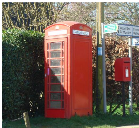
Picture 10. Well restored K6 Telephone kiosk, an iconic piece of British tradition. Its continued use as a Defibrillator is most welcome. This use is becoming increasingly common.

5.26. K6 Telephone Kiosk. Designed 1935 by Sir Giles Gilbert Scott. Made by various contractors. Cast iron. Square kiosk with domed roof. Unperforated crowns to top panels and margin glazing to windows and door. Many of this type are listed but this one is not.