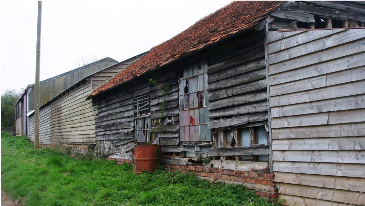
Picture 43. Buildings interpreted as curtilage listed at Coates Manor Farm on the Council's Heritage at Risk Register in urgent need of repair on this important approach to the village.

5.90. Other non listed buildings that make an important architectural or historic contribution. This Appraisal identifies two other buildings of high quality that are not listed but that should be retained. These date from the late 19th century. Any important architectural features they possess and worthy of retention are identified.