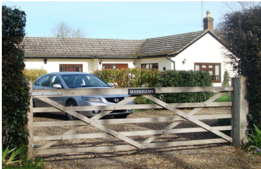
Picture 23. Markham's a bungalow from the 20th century on the edge of the conservation area is of insufficient architectural or historic interest to warrant continued inclusion in the conservation area.

(c) Exclude Markhams from the conservation area as the building which is located on the edge of the conservation area and dates from the mid 20th century is of insufficient architectural or historic interest to warrant continued inclusion.