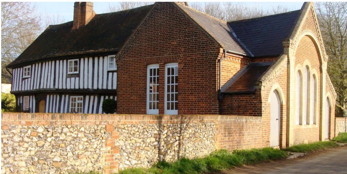
Picture37. Grade II* Farmhouse dating from the late 16th century with 19th century Chapel. Unusual and a visual focal point at Wood End.

5.77. Farmhouse at Chapel Farm including former Congregational Chapel - Grade II*. House and former Chapel, now one property. House late 16th century. Timber frame with close-studding exposed on front and rear. Steep old red tile roof. Very heavy exposed floor joists. A little altered 16th century jettied house of great interest. Former Congregational Chapel at east end of house, erected 1820 as a preaching station for Wymondley Academy and rebuilt 1862 (date stone on east front). Red brick with slate roofs. Grey brick used for pilasters and polychrome arch and raking cornices on east front, side lean-to porches. Triple round-headed stone window. Pointed moulded stone doorways. Became part of house in 1970's.