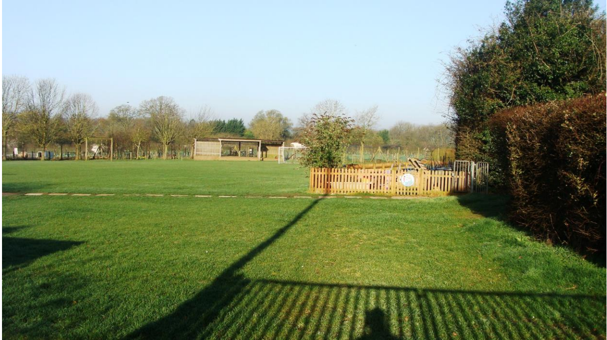
Picture 22. Sports Ground associated with nearby school which appears to be more part of the open countryside as opposed to the adjoining architectural and historic elements of the conservation area.

(c) Exclude Markhams from the conservation area as the building which is located on the edge of the conservation area and dates from the mid 20th century is of insufficient architectural or historic interest to warrant continued inclusion.