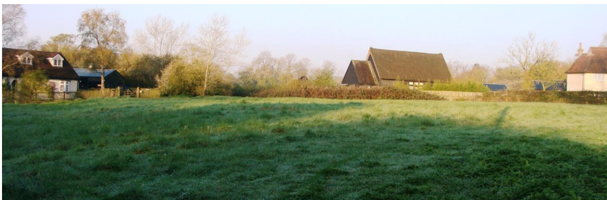
Picture 47. The centrally located green at Wood End is a key feature that makes an important visual contribution to the conservation area.

5.97. Strategically located in the centre of Wood End, this green although separated by access points, forms an open space of considerable visual importance to the form and identity of the conservation area which provides the historic and visual setting for several buildings including some that are listed.