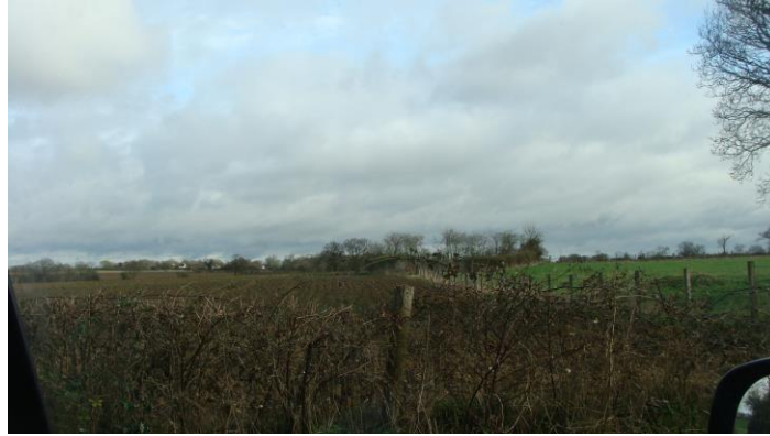
Pictures 49-51. Various areas of extensive agricultural land that relate to the open countryside and now removed from the conservation area.