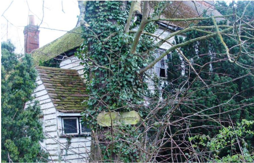
Picture38. Spring Grange - a building on the Council's Heritage at Risk Register in need of restoration.

5.79. Farmhouse at Cherry Farm - Grade II. Early 17th century incorporating 16th century south wing. Timber frame on stepped red brick plinth, roughcast with steep old red tile roofs. A 2-storey, T-plan, central-chimney, lobby-entry plan house facing east. 3 windows to each floor on east front with door in line with tall red brick central chimney with moulded base and 5 conjoined diagonal shafts in-line axially.