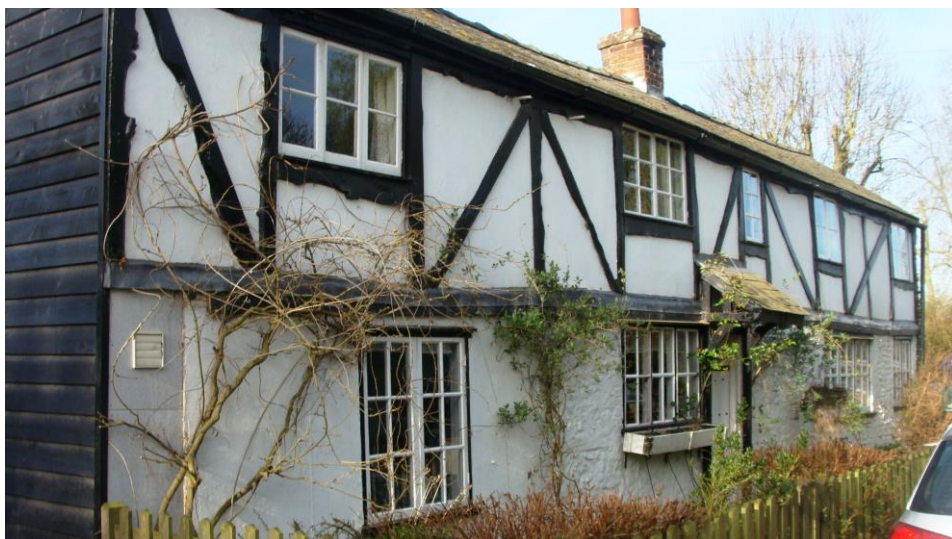
Picture 44. Sandford Cottage an interesting non listed building that adds to the quality of the conservation area and its evolution and which should be retained.

5.91. Sandford Cottage - Building probably of late 19th century origin. Two storeys render with decorative wooden detailing to front. Slate roof, 2 No. chimneys with pots. An Article 4 Direction to provide protection for selected features may be appropriate subject to further consideration and notification.