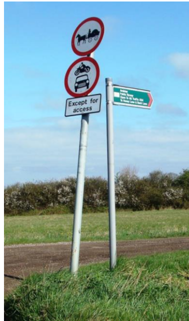
Picture 33. Pole out of correct vertical alignment detracts. Would it be possible to combine all necessary information on one pole?

Moor Green believed to be Common Land owned by the PC (the PC have subsequently advised they have sought volunteers to attend to this matter). Re-erect highway sign on green to correct vertical alignment. Alternatively would it be possible to combine the information on the two poles to be on one pole only? The reader might consider these suggestions are very minor but the fieldworker is of the opinion that even the smallest improvements are worthwhile.