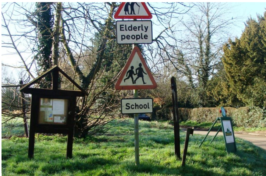
Picture20. Are all of these signs necessary? Could they be re-sited more appropriately? At least those out of vertical alignment could be reset.

5.37. Collection of miscellaneous signage corner of School Lane. The possibility of achieving some improvements is worthy of investigation.