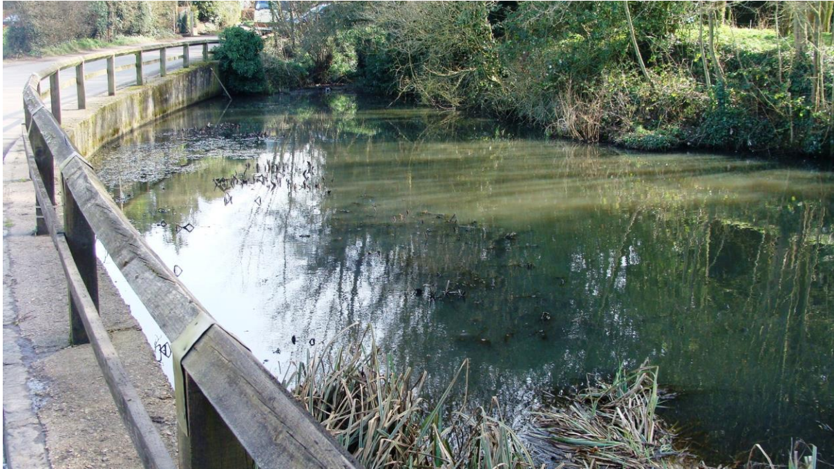
Picture 17. Pond to front of church is an important visual and ecological feature. The railings are well designed and in keeping.

5.33. Water features. The pond to the front of the church has an abundance of wildlife and makes an important visual feature in the street scene. There is also a smaller pond on the central area of rough grass land east of School Lane.