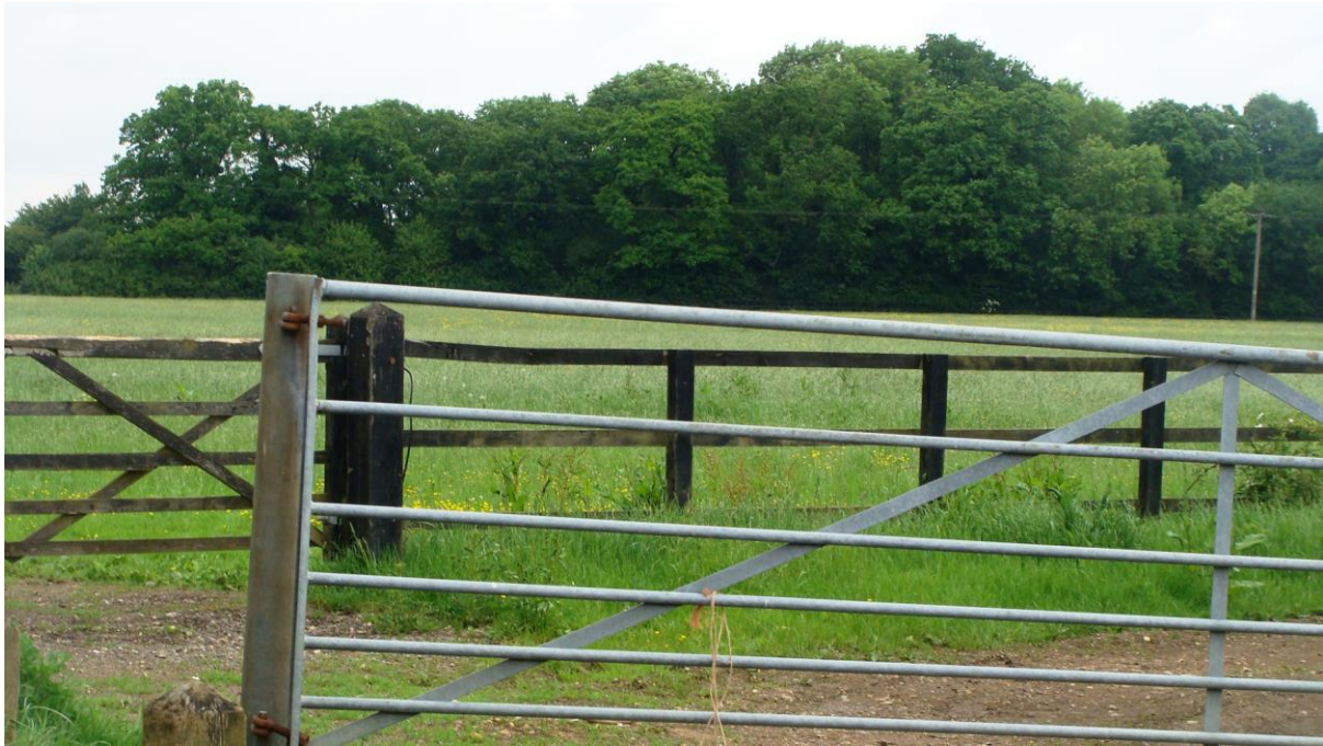
Picture 36. Land to the north of Moor Hall Farm, clearly forming part of the wider open countryside.

5.71. Overall Summary - Moor Green. Moor Green is considered to justify its status as a conservation area but the area should be restricted to the main green and surrounding listed buildings and Scheduled Ancient Monument Site. The inclusion of other very extensive areas of open countryside forming part of the wider landscape is considered to be inappropriate.