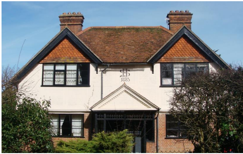
Picture 8. Nos. 1-2 Church End. A pair of symmetrical late 19th century properties with distinctive roof and chimney details.

5.22. Nos. 1-2 Church End. Plaster/parquetted with vertical tile hung detail. Steeply sloping tiled roof and 2 No. prominent chimneys with pots. Central date plaque reads 1883. An Article 4 Direction to provide protection for selected features may be appropriate subject to further consideration and notification.