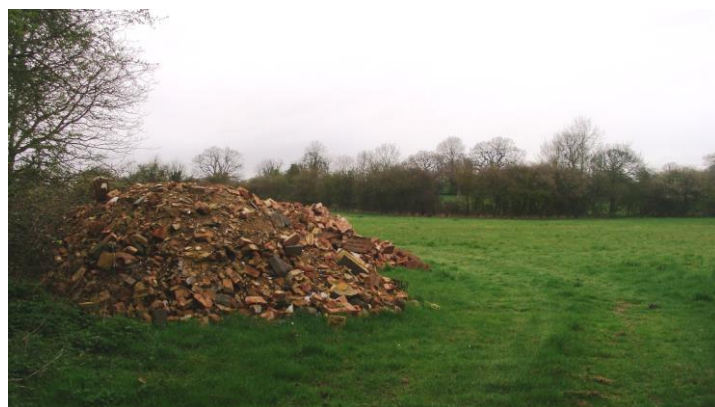
Picture 53. Pasture land to west of Coates Manor Farm. This land is now excluded from the conservation area because its relationship is much more closely associated with the open countryside.

(b) exclude a tract of countryside to the west of Coates Manor Farm and north of Spring Grange.