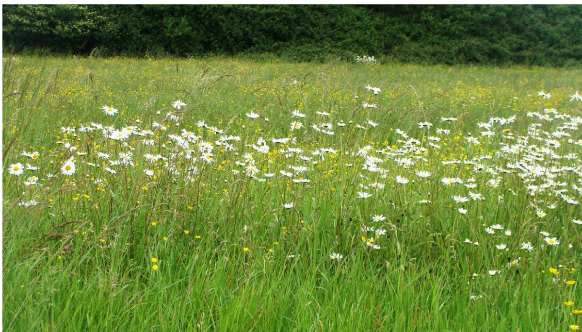
Picture 32. Neutral wildflower meadow on Moor Green Grassland, the central green, focal element of the conservation area.

5.64. Particularly important trees and hedgerows. Those trees that are most important are shown very diagrammatically on the accompanying plans. It has not been possible to access some agricultural boundaries and in these cases the location of trees as shown has been interpreted from satellite information.