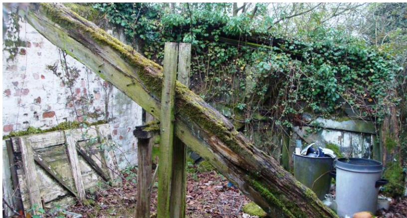
Picture 42. Ancillary curtilage listed building within curtilage of Spring Grange that is in very poor condition. It has been on the Council's Heritage at Risk register for a number of years and this structure together with the main building (see above) continues to deteriorate.

5.86. Ancillary building within curtilage of Spring Grange. In very poor condition. The fieldworker has been advised this site has recently been acquired (Application for 3 dwellings now submitted). It is hoped appropriately sensitive restoration works can be carried out.