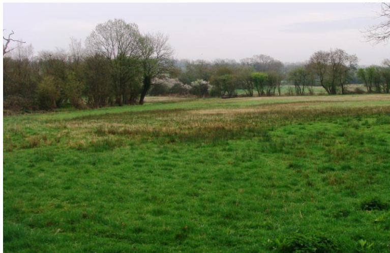
Picture 31. The very extensive area of Moor Green Meadows, an area of Special Scientific Interest (SSSI). The site is afforded protection by Natural England and removal from the conservation area does not reduce protection; for example works to trees would need to be referred to Natural England.

habitats for nesting birds. The site is essentially open countryside and is protected by Natural England. Whilst it is of significant natural importance the relevance with architectural and historical associations is limited. As such most of the area is now excluded from the conservation area (Great Wood which also forms part of the Scheduled Ancient Monument remains in the conservation area principally because of its historic associations and also because of its visual importance). Permission to undertake certain works, including works to trees, would be required from Natural England.