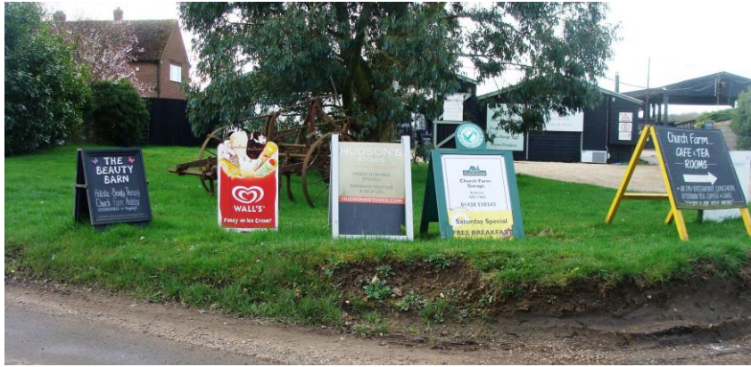
Picture 19. Discuss potential of making improvements with owner/s.

5.37. Collection of miscellaneous signage corner of School Lane. The possibility of achieving some improvements is worthy of investigation.