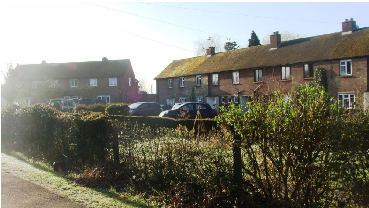
Picture 21. Part of The Crescent. These terraces are excluded from the conservation area because they are considered to be of insufficient architectural and historic interest.

(a) Exclude Nos. 1-8 The Crescent from the conservation area. This group of three terraces date from the mid-20th century and has little or no architectural or historic interest. Being on the edge of the conservation area their removal can be easily effected.