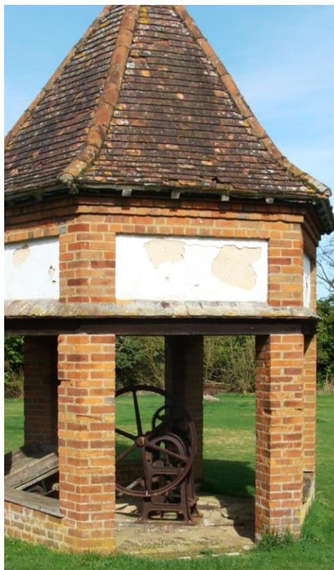
Picture 4. Village pump and well house. Simple repair works at modest cost would result in significant improvements. Without prejudice financial assistance may be available.

5.14. Village Pump and Wellhouse - Grade II. Circa 1917 by F. C. Eden for John Howard Carter of The Bury. Cast iron pump with large flywheel. Red brick well house with plastered panels and hexagonal old red tile cap with gilded vane and bellcast eaves. Centrepiece of picturesque Blaise Hamlet type scheme at The Green.