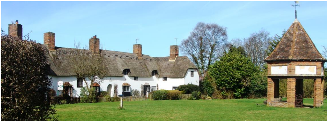
Picture 11. The Green west end of Ardeley. Maintaining its open character is most important.

5.28. The Green. This small enclosed open space is of considerable visual importance in setting off the early 20th century thatched properties and centrally located pump and well house. Maintaining its openness is most important. This area was previously the site of a large house demolished in the 19th century. It is understood the annual fair/fete is held here.