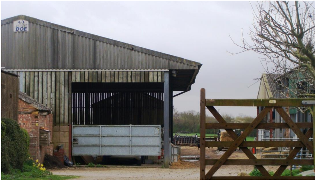
Picture 54. Modern agricultural buildings of no architectural merit or historic interest to rear of Highbury Farm and now excluded from the conservation area.

5.108. Other Actions. Consider additional native planting to gap up and better define southern edge of small green at extremity of the conservation area to east of Coates Manor Farm.