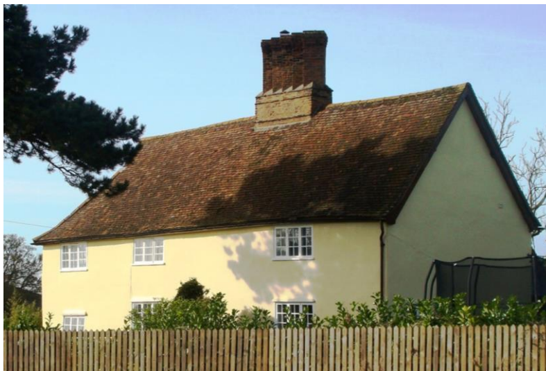
Picture39. Farmhouse at Cherry Farm with fine diagonal multi shafted chimney.

5.79. Farmhouse at Cherry Farm - Grade II. Early 17th century incorporating 16th century south wing. Timber frame on stepped red brick plinth, roughcast with steep old red tile roofs. A 2-storey, T-plan, central-chimney, lobby-entry plan house facing east. 3 windows to each floor on east front with door in line with tall red brick central chimney with moulded base and 5 conjoined diagonal shafts in-line axially.