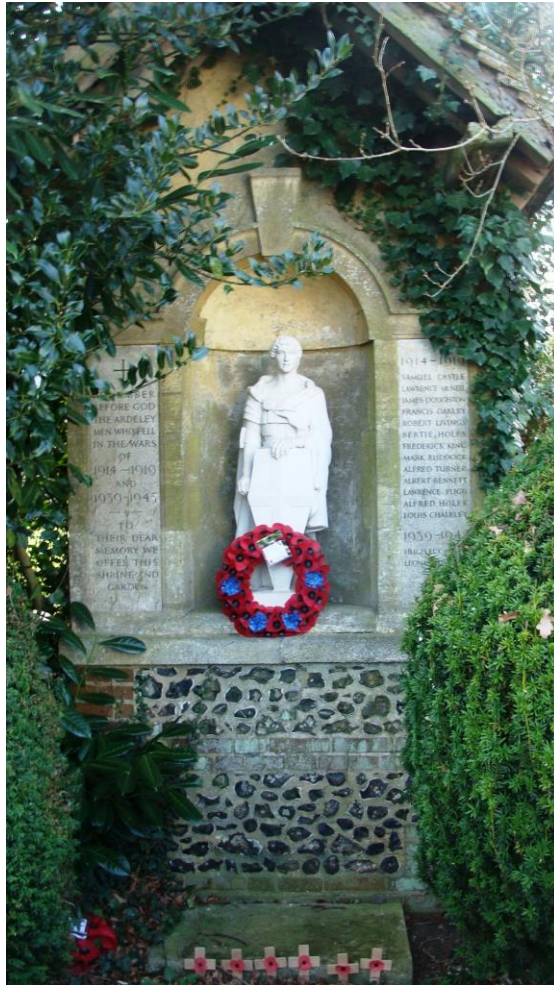
Picture3. War Memorial- a most unusual design. Removal of selected vegetation would be advantageous. The fieldworker was advised the central figure of St George is a replacement following theft of the original.

5.9. Aisled barn at Church Farm - Grade II. 17th century possibly incorporating an earlier aisled framework. Timber frame on red brick sill with steep pitched roof now of corrugated iron. A 5-bay tall aisled barn. Clapsed purlin roof with inclined queen-posts except in end bays. This barn now converted to residential use with thatched roof.