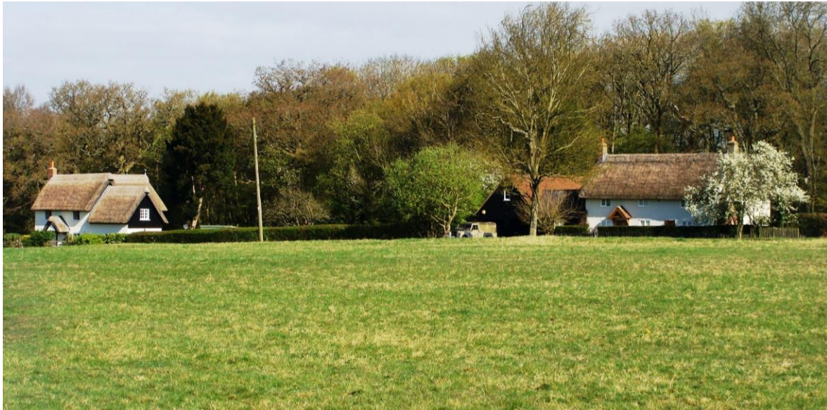
Picture 28. Two high quality listed buildings which together with the wood behind frame the extensive green when viewed from the south. Woodside Cottage on the left is described as having a pantiled roof at time of entry??

roof. Large red brick external gable chimney. Flush 2-light cast iron casements with small panes and segmental arches to ground floor.