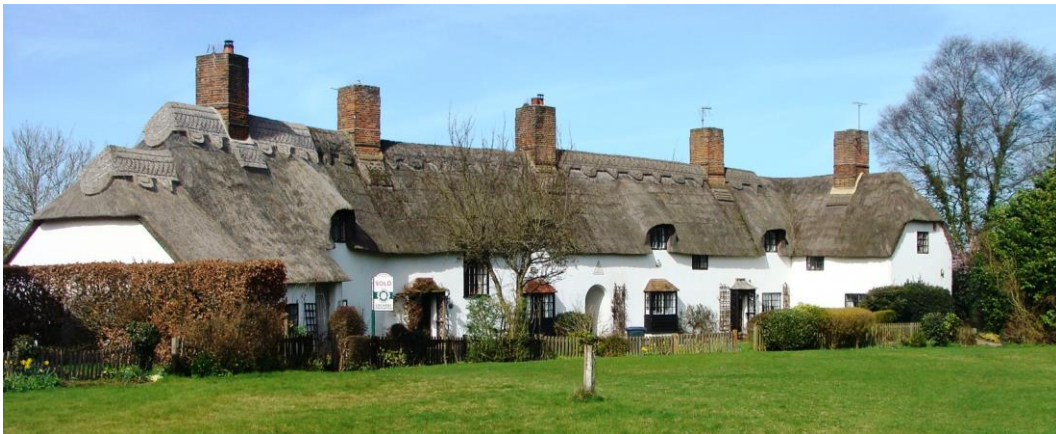
Picture 5. Early 20th century picturesque housing on The Green, unusual and most picturesque.

5.16. The Green Nos. 1, 2, 3, 4 - Grade II. Block of 4 houses. 1918 (plaque on front) by F. C. Eden for John Howard Carter of The Bury as part of a picturesque Blaise Hamlet type scheme at The Green. Roughcast brick with black plinth and steep thatched roofs, hipped at south, half-hipped at north. An irregular U-shaped block facing east. One and a half storeys with central arched tunnel, 5 large square red brick central chimneys, and 4 eyebrow dormers along the front eaves. Small square tiled and weather boarded bay window with 2 small-paned casements, to each side of central arch. Oak plank doors in trellis porches with tented lead roofs. Triangular ceramic plaque over archway 'H/J.C./A. 1918.D/MELIORIS AEVI'.