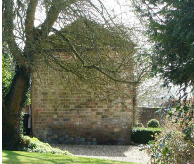
Picture 6. Ancillary building in the curtilage of The Old Vicarage, viewed from road. Unusual brick construction - Rat Trap bonding.

5.19. Building interpreted as being within curtilage of 'Aisled Barn at Church Farm' (the latter now converted to residential). Weather boarded with tiled roof. Restored. Runs north to south along access to The Homestall.