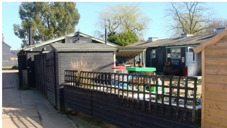
Pictures 24-25. Buildings to frontage of Church Farm whose architectural qualities are of poor quality and inappropriate to the conservation area and now excluded from it.

(e) Rationalise boundary to east and south of Redbrick Cottages. Minor modifications have been made in this location to exclude frontages at Churchfield and Mead Farm at the eastern extremity of the conservation area. At same time the boundary is extended to ensure trees of some quality to the village approach opposite Redbrick Cottages are within the conservation area and thus afforded some protection. (Previously these trees formed the boundary and thus ambiguity as to whether they were located within or beyond the conservation area might have arisen).